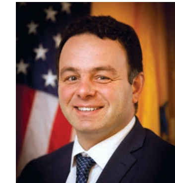
ANDRÉ SAYEGH Mayor, City of Paterson