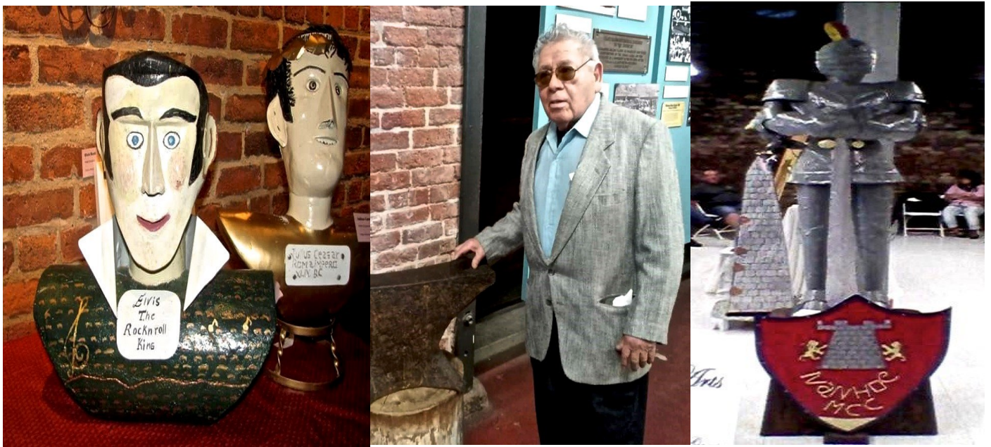
Exhibit Opening Reception: Saturday August 17th from 3 to 5 PM

The Paterson Museum 2 Market Street, Paterson, NJ 07501 For Information call: 973.321.1260