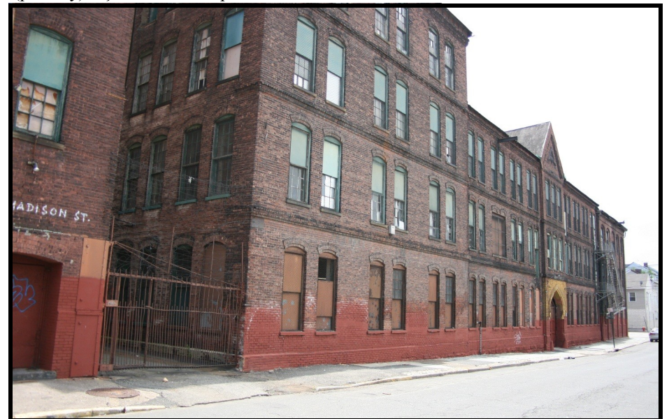
STRANGE 12: Oblique overview looking SE from Madison St. showing primary façade and main entrance (yellow) along Madison St.