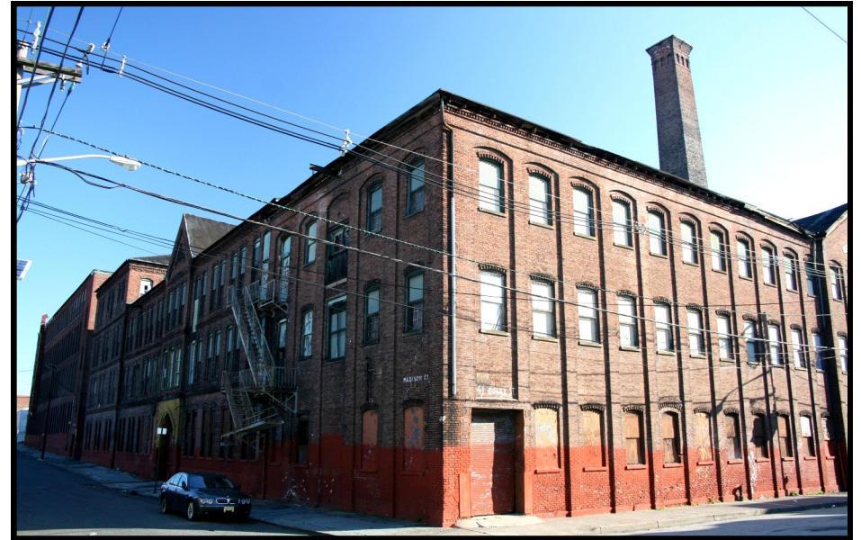
STRANGE 2: looking NE from corner of Madison St. (lft) and Essex St. (rgt) This is today's view of the historic photo in Strange 1 to the left. Note the smokestacks.