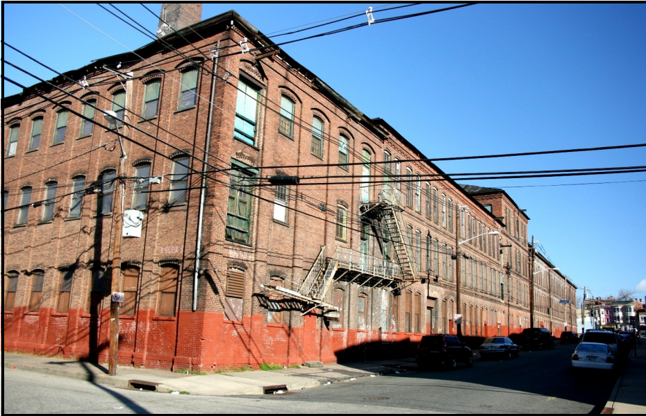
STRANGE 5: oblique overview looking NE down Beech St. from corner of Essex St.