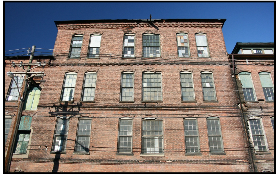
STRANGE 6: detail view looking W from Beech St. showing central bay fronting Beech St. Note the permanent enlargement to the center sets of windows.