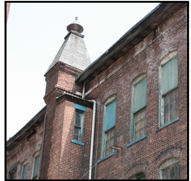
STRANGE 16: detail view looking NE from interior courtyard, showing detail and integrity of roofline on rear of the Beech St. expansion mill.