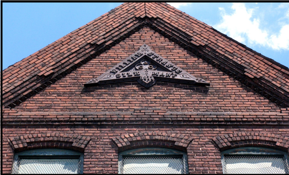
STRANGE 11: close up view looking E of the cast iron name plate located in the central entrance gable seen in Strange 10 (upper rgt) "William Strange Silk Man'f."