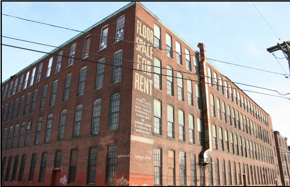
STRANGE 13: oblique overview looking SE from corner of Madison and Morton St. of the last Strange complex's 1900s 4-story addition.