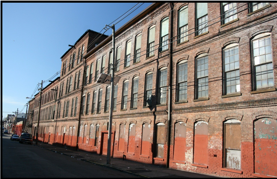
STRANGE 7: oblique overview looking SE down Beech St. from corner of Morton St. showing the Beech St. side of the complex. The taller central bay is detailed in photo Strange 6 (upper right).