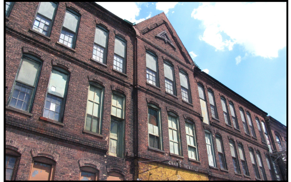
STRANGE 10: detail view looking SE, showing central entrance on the Madison St. (primary) façade. Note the permanent window conversions to entrances.