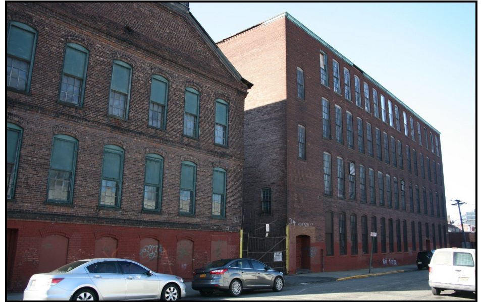
STRANGE 14: oblique view looking W, showing Morton St. side of the 1900s addition on the right side, and the N gable end of the 1880s expansion along Beech St. on the left.