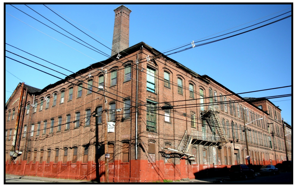
STRANGE 4: oblique overview looking NW looking NE from corner of Beech St. (rgt) and Essex St. (lft). The American Velvet Co. building defines the corner, but it is clear by the mismatched roofline where the Beech St. expansion started in the 1880s.