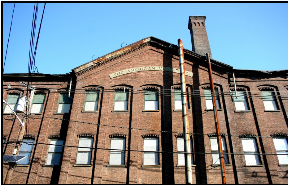
STRANGE 3: detail view looking N from Essex St. The name plate in the gable is for the American Velvet Co. an existing L-shaped mill complex that Strange purchased and expanded his new complex from.