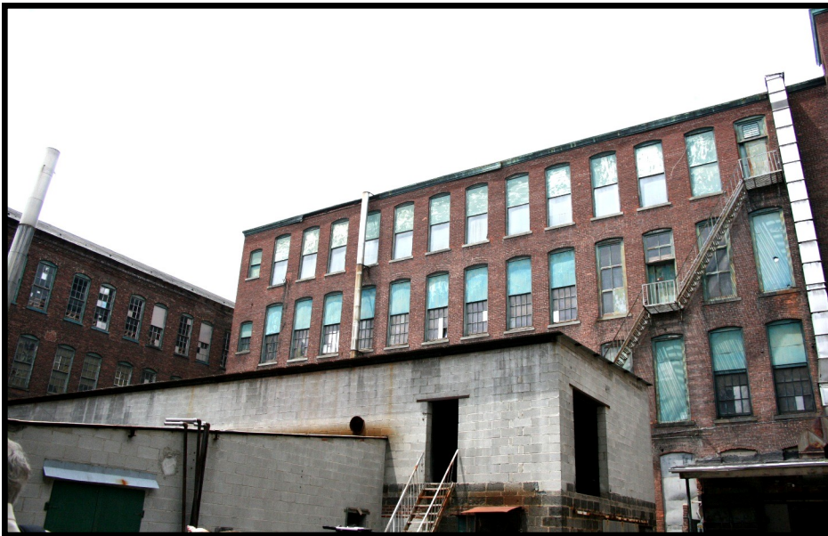
STRANGE 15: overview of interior courtyard looking SW, showing non contributing concrete block buildings in foreground.