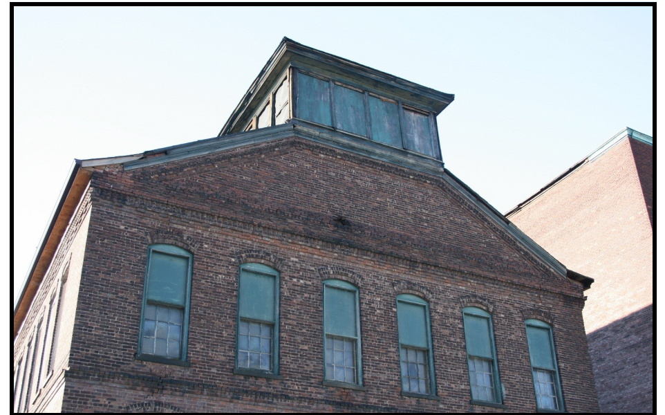
STRANGE 8: detail view of N gable end looking SW, showing intact central clerestory that runs the length of the building.