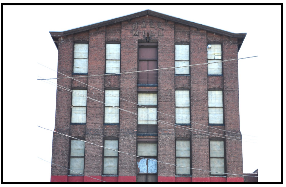
HALL 10: detail view of West gable end of the 1899 mill building, looking E from Straight St. The integrity of this façade is clear, including the covered original windows