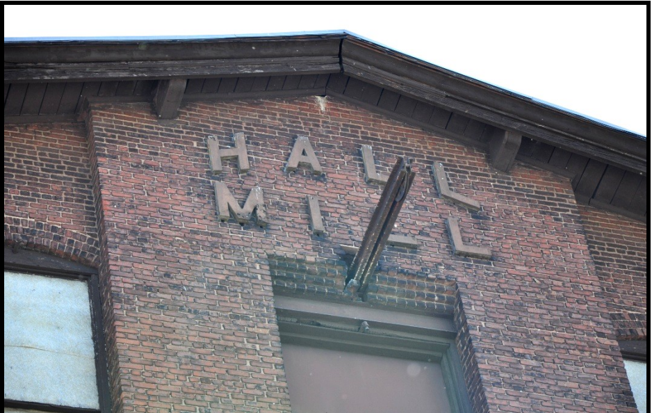
HALL 11: close up view of West gable end of the 1899 mill building addition, looking E from Straight St. showing the Hal Mill name in sandstone lettering. The integrity of the open eaves and cornice moldings emphasizes the historic character of the mill addition.