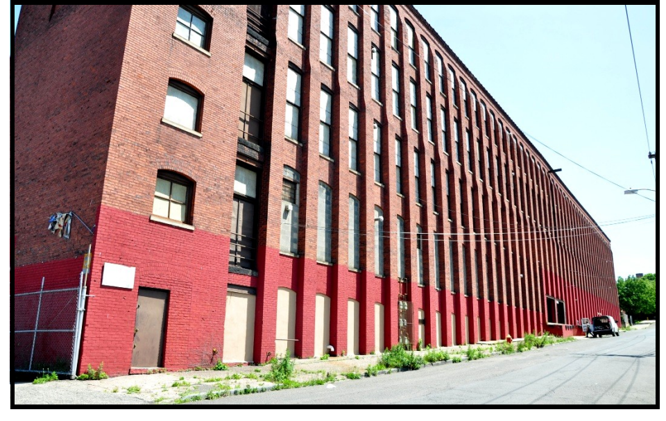
HALL 15: oblique overview of South side of 1910s building, looking E along Harrison St., demonstrating the impressive scale and integrity of the site.