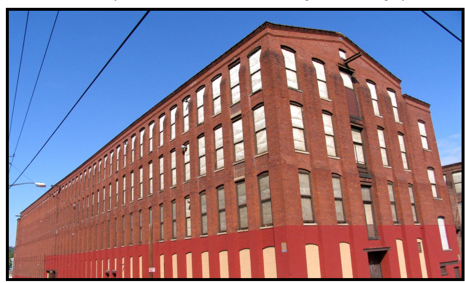
HALL 20: Oblique overview looking NW from corner of Harrison and Summer St., showing East gable end and Harrison St. (South) elevation of the 1910s Hall Mill.