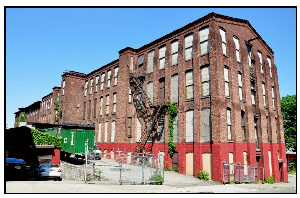
HALL 5: oblique view looking SW from Kearny St. showing Totowa Ave. façade.