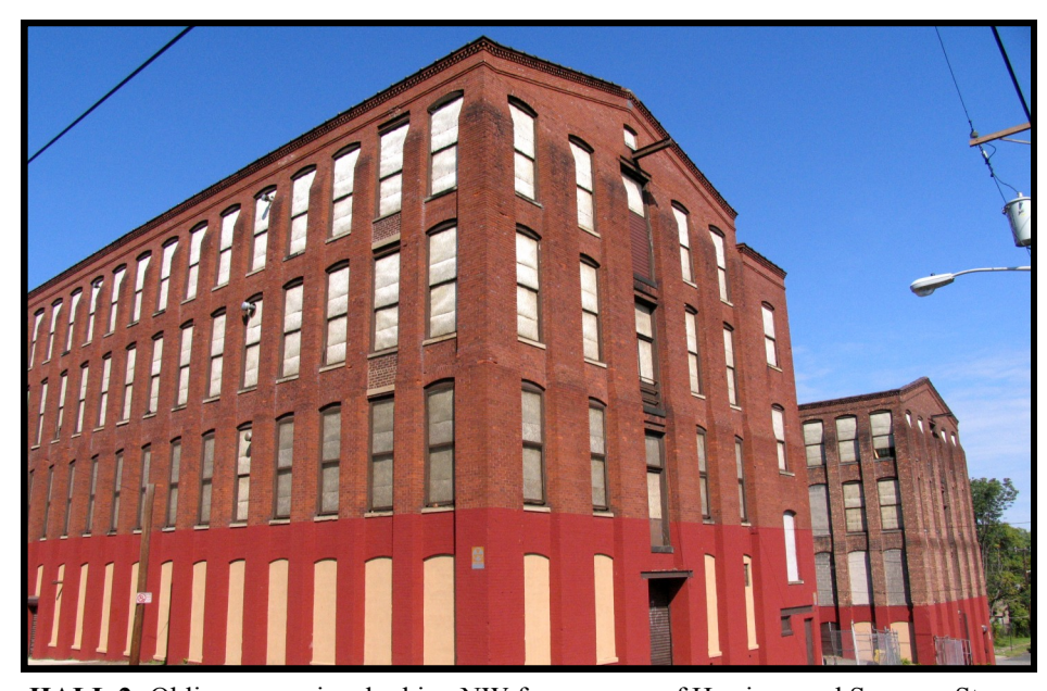
HALL 2: Oblique overview looking NW from corner of Harrison and Summer St., showing East gable ends of the twin Hall mills.