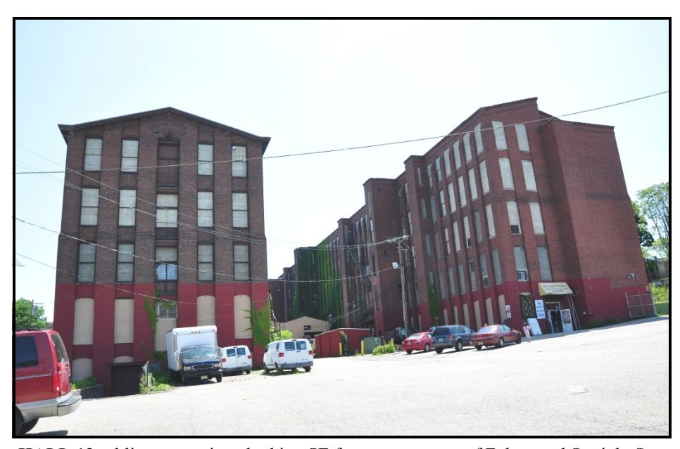
HALL 13: oblique overview looking SE from near corner of Fulton and Straight St. showing West gable ends of both Hall Mills. This view offers particular integrity.