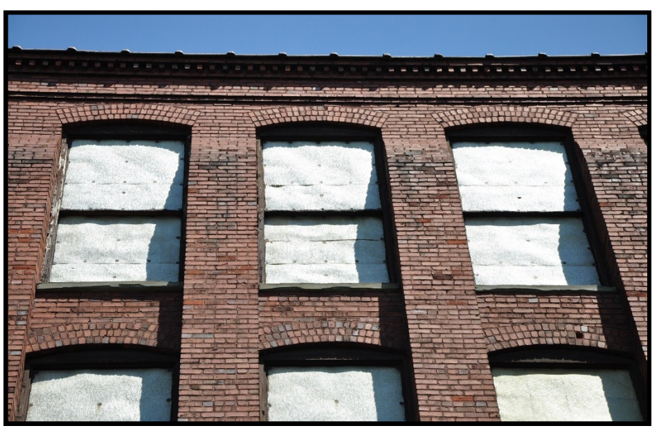
HALL 18: detail view of South side of 1910s building, looking N from Harrison St., showing brick dentils, stringcourse detailing, and use of terra cotta coping. Segmental arched windows may be extant behind the white covering material. Integrity is clear.