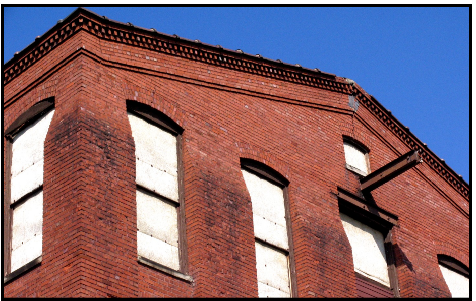
HALL 4: close up view of 1910s building east gable end, looking NW. Details of interest are clearly shown: meticulous brick corbelling and running course work of the closed eaves, the terra cotta coping, and the gradual-stepped buttressed pilasters.