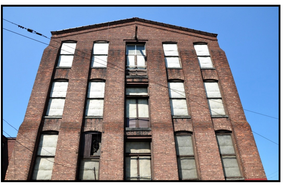
HALL 6: oblique view looking NW, showing Kearny St. façade.