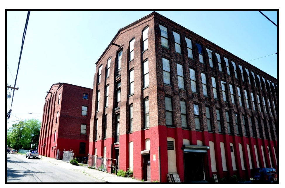
HALL 7: Oblique overview looking SW from corner of Fulton and Summer St. (left side), showing East gable ends of the twin Hall mills. The c1899 mill is in the front.