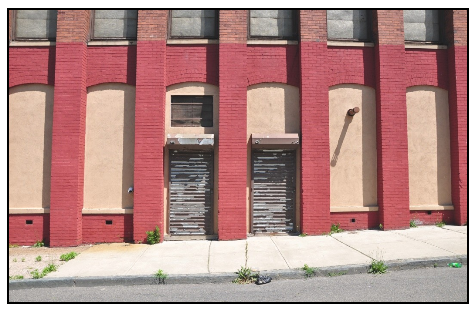
HALL 17: detail view of South side of 1910s building, looking N from Harrison St., showing additional entrance modifications made to accommodate tenant reuse. These two entrances are just east of loading docks showing in Hall 16.