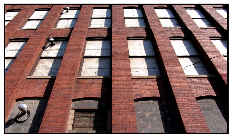
HALL 19: detail view of South side of 1910s building, looking N from Harrison St., showing consistent, reversible modifications to window openings (fenestration).