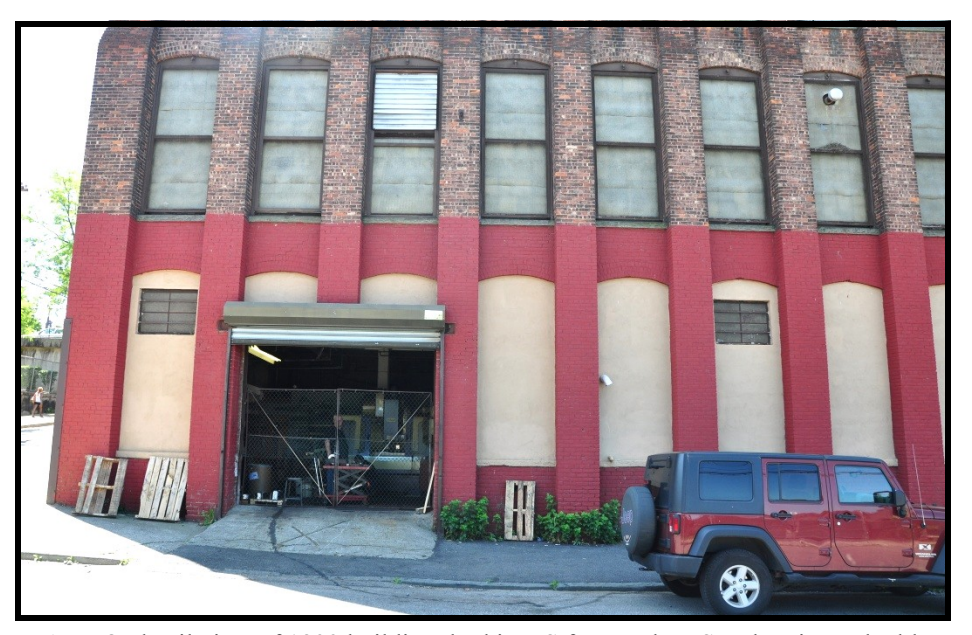
HALL 8: detail view of 1899 building, looking S from Fulton St., showing a double bay entrance modification made to accommodate a machine shop tenant.