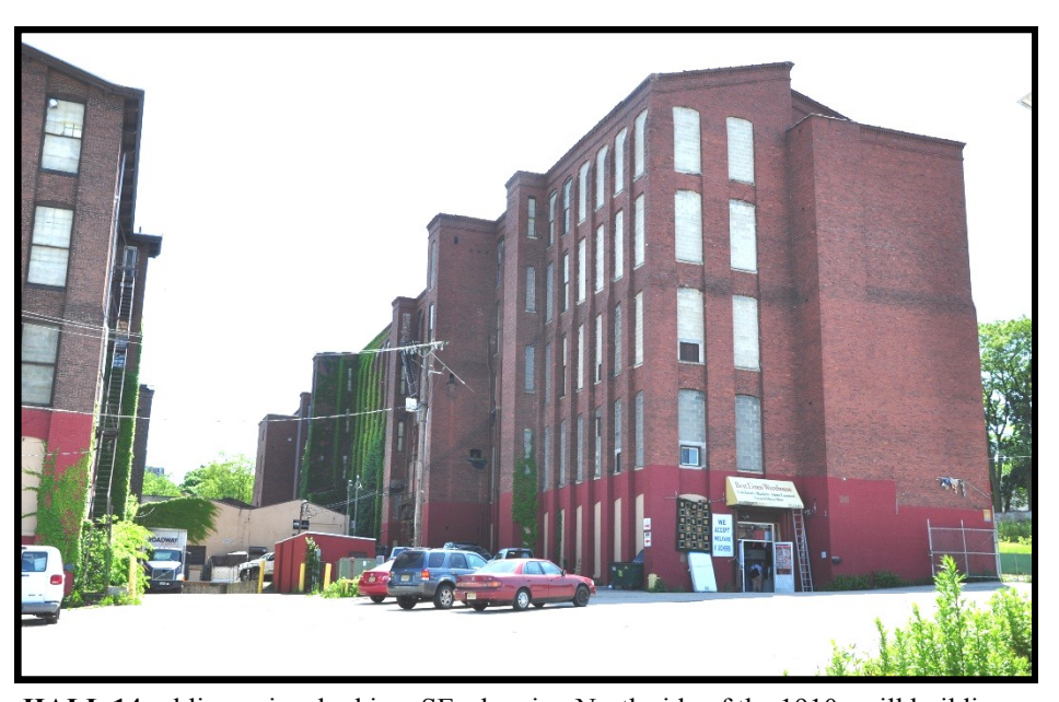
HALL 14: oblique view looking SE, showing North side of the 1910s mill building, and view of the boiler house centralized power station at center.