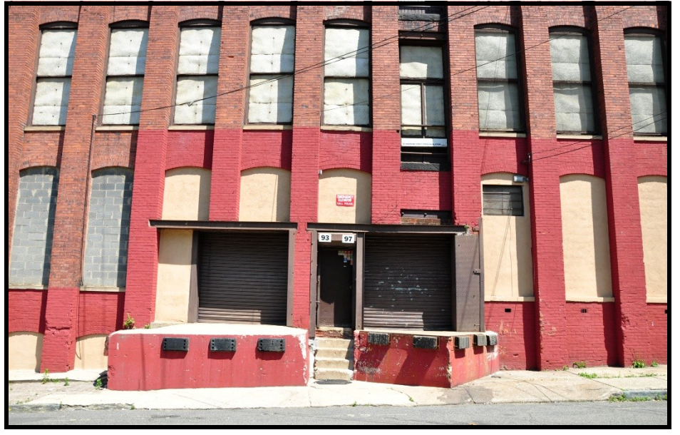
HALL 16: detail view of South side of 1910s building, looking N from Harrison St., showing several loading dock and entrance modifications made to accommodate tenant reuse.