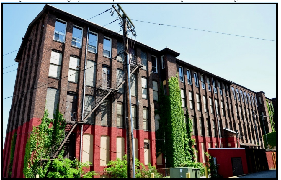
HALL 12: Oblique overview looking NE. Note the vinyl replacement windows along the top floor to accommodate tenant reuse.