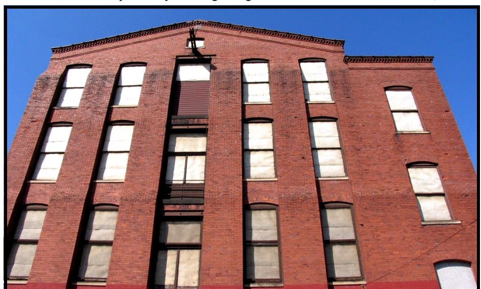
HALL 3: Detail view of 1910s building east gable end, looking W.