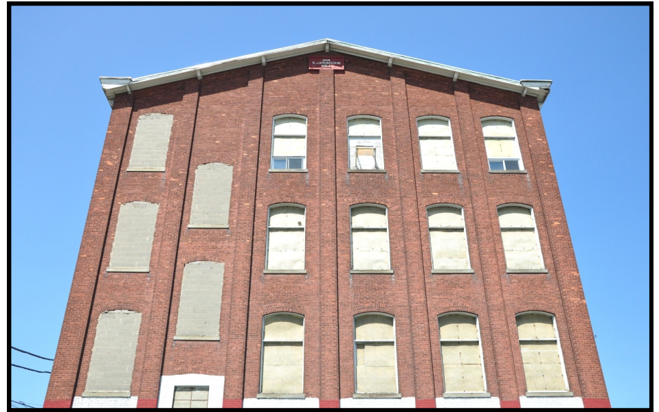
ARONSOHN 6: Detail view of West gable end, looking east from 16 th St. Note entablature name plate mounted just under the peak at center.