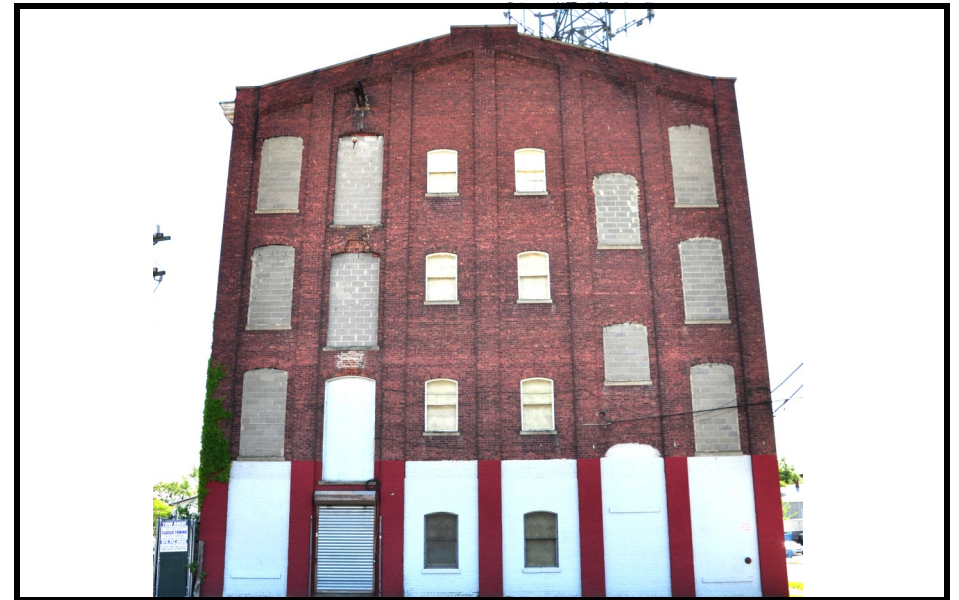
ARONSOHN 8: Overview of East gable end, looking west from 18 th St. Note the modifications to windows and roll up door entrance.