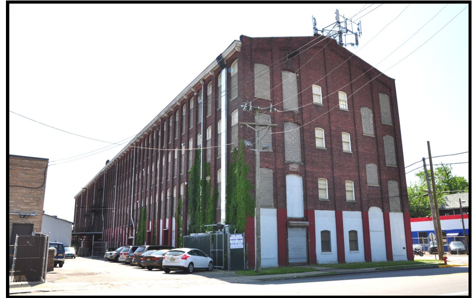
ARONSOHN 2: Oblique overview looking NW from 18 th St., showing the East gable end and the rear of the mill.