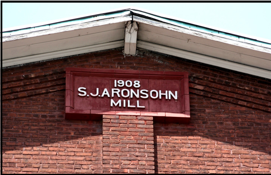
ARONSOHN 7: Close up view of cast stone entablature name plate mounted just under the roof peak of the West gable end of the mill.