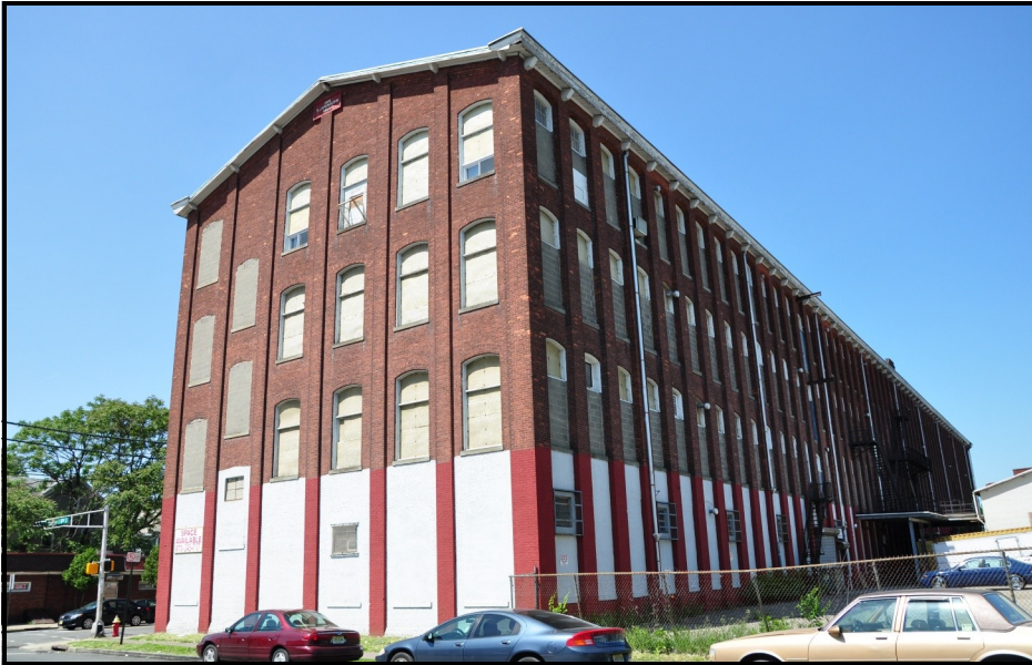
ARONSOHN 5: Oblique overview looking NW from 16 th St., showing the West gable end and the rear of the mill.