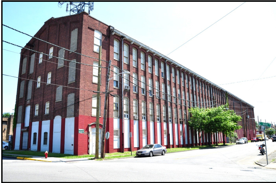
ARONSOHN 1: Oblique overview looking SW. The length of the mill is situated along Tenth Ave. and the East gable end faces 18 th St.