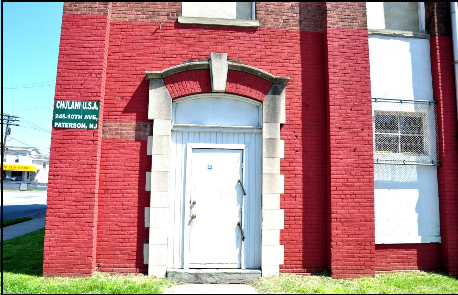
ARONSOHN 9: Detail view of east entrance on North side. Note the quioning and semi segmental hooded pediment with exaggerated keystone, which are classicizing elements that are indicative of F.W. Wentworth's design of the building.