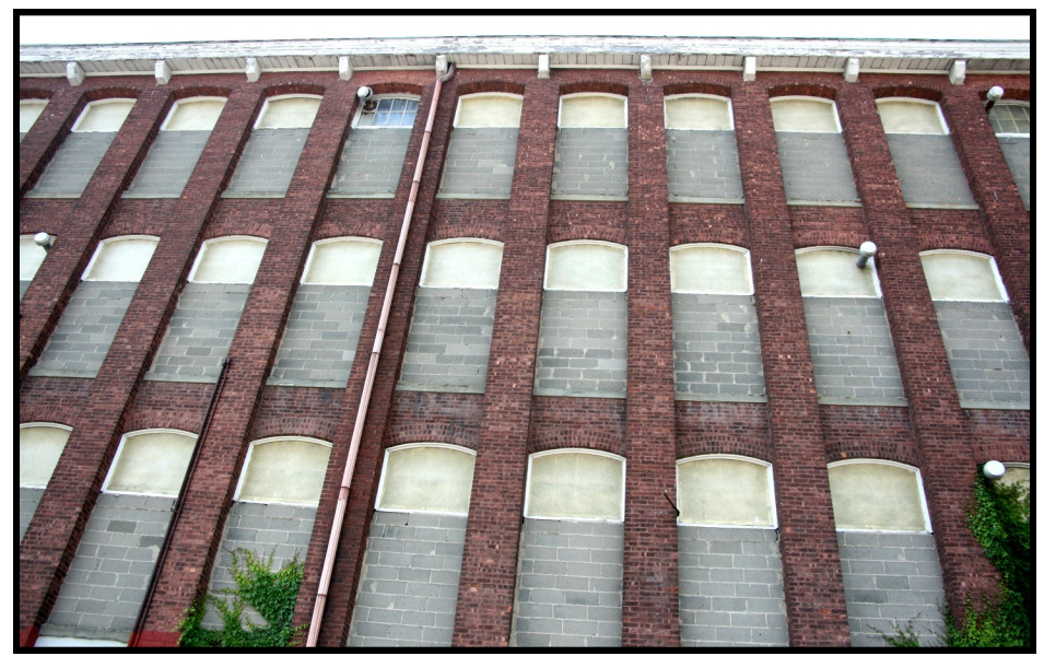
ARONSOHN 4: Detail view looking S from Tenth Ave. sidewalk. Note double hung window frames are intact, but lights have been replaced consistently with concrete block infill.