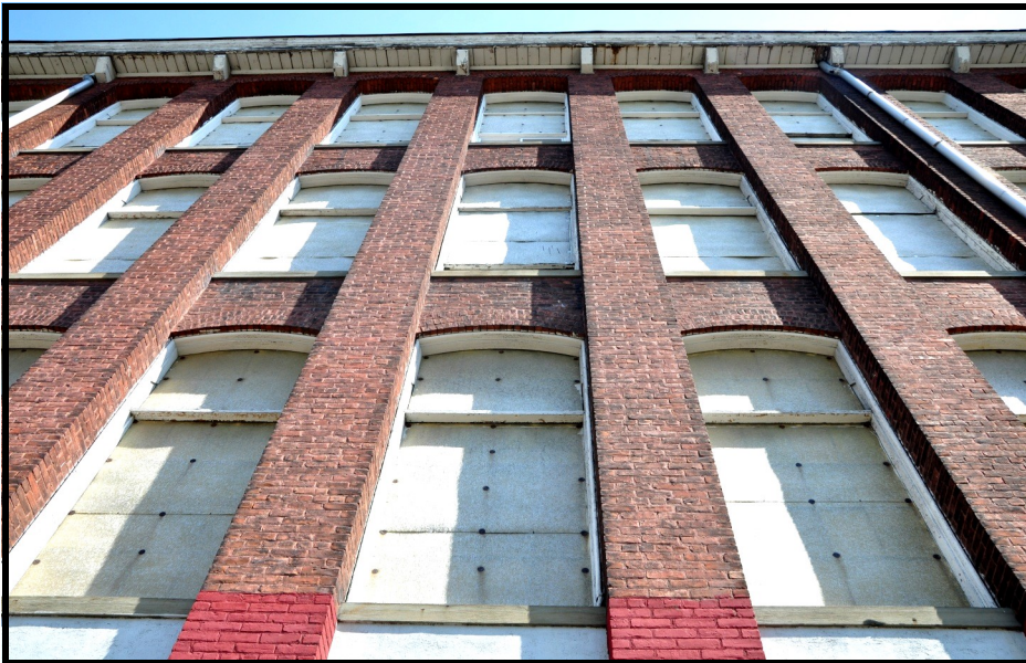
ARONSOHN 3: Detail view looking S from Tenth Ave. sidewalk. Note slight pilasters between each window, open eaves, segmental arched, double hung window frames are intact, but lights that have been replaced with an opaque infill material.