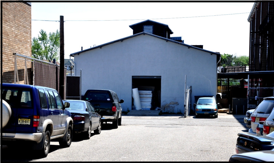
ARONSOHN 11: View of boiler house building behind the mill, looking west. The building is historically the only ancillary building on the complex, and remains extant today.