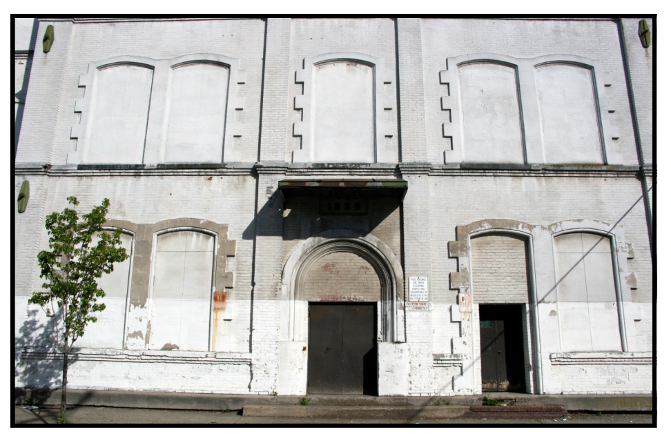
RIVER 4: detail view of central entrance bay of S façade looking N from River St. showing full arched double wide main entrance with marquee.