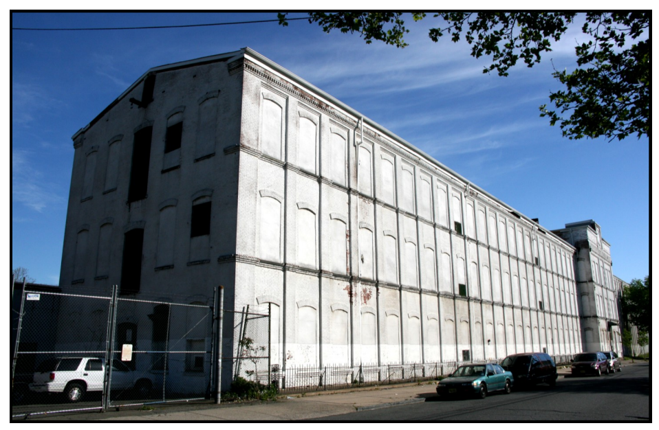
RIVER 1: oblique overview of South façade fronting River St., looking E. Center entrance bay is to far right.