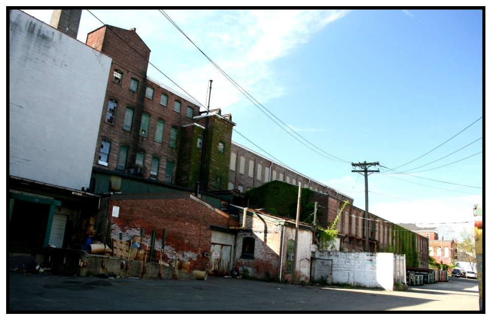
RIVER 9: oblique overview looking SW from rear of complex showing ancillary buildings in foreground and 1900s two story west wing addition in distance.