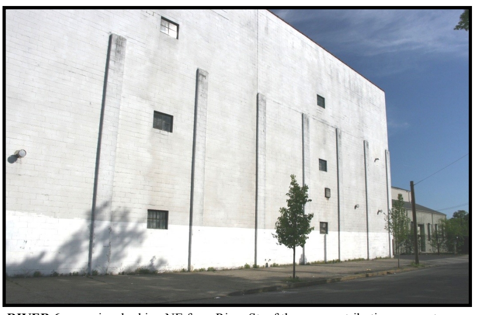
RIVER 6: overview looking NE from River St. of the non-contributing, concrete block addition to the east end of the main building .