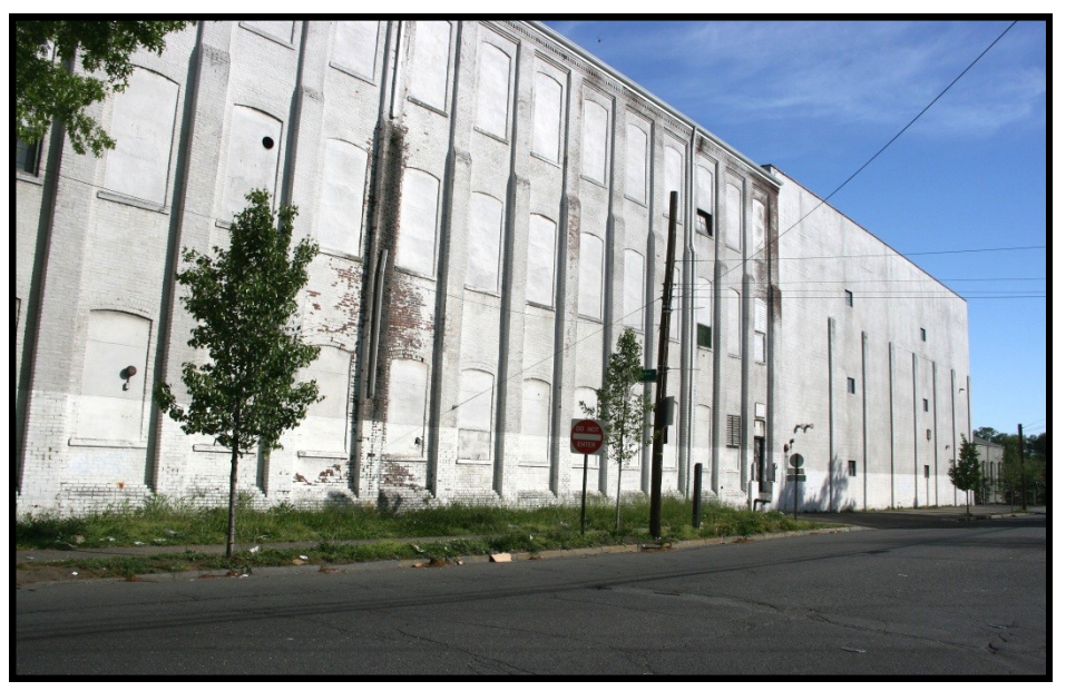
RIVER 5: oblique overview of S façade fronting River St. on the east side of the main entrance. Note the concrete block non-contributing addition.