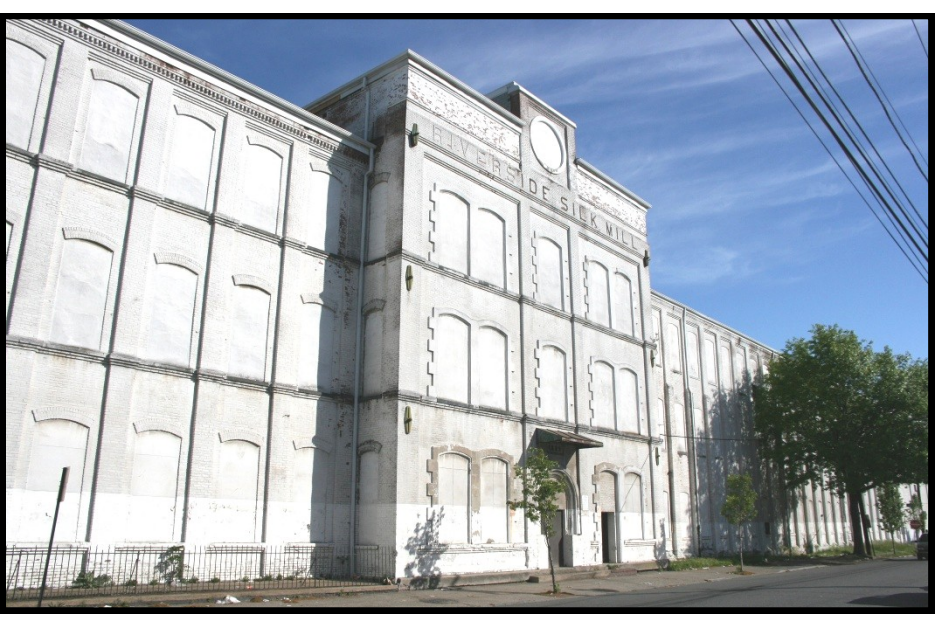
RIVER 2: oblique view of central entrance bay of S façade fronting River St.