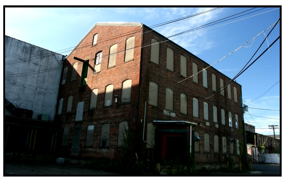
RIVER 8: oblique overview looking SW of a small brick, three story mill building is extant behind the main buildings. Its use is not known.