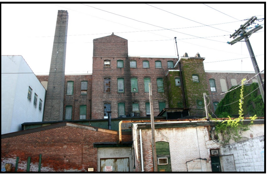
RIVER 10: detail view looking S from rear of complex showing smokestack, boiler house, ancillary buildings and rear of the central section of the main mill.