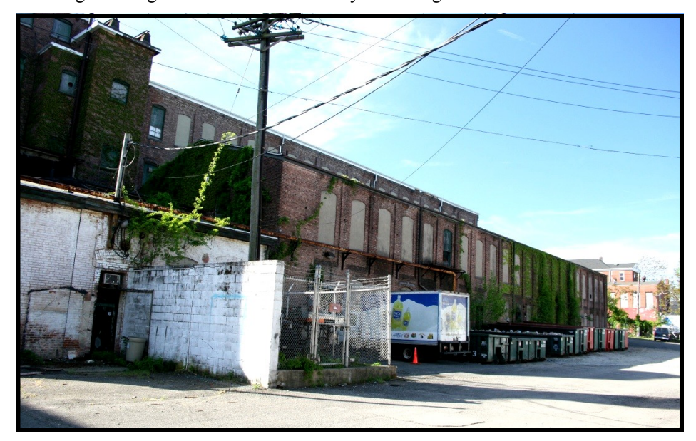
RIVER 11: oblique detail view looking SW from rear of complex showing 1900s addition of a two story west wing behind the 1890s main building.