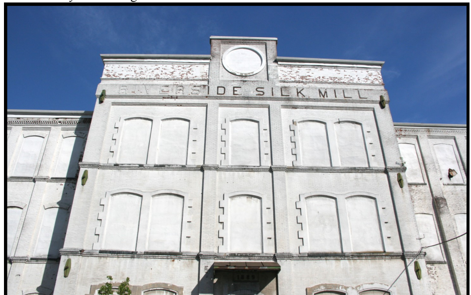
RIVER 3: detail view of central entrance bay of S façade looking N from River St. classicizing embellishments are present, such as the cast stone surrounds and quoining effects on windows, central oculus, faux pilaster columns, and string courses.