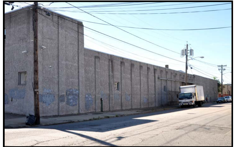
SUSQUEHANNA 6: oblique overview of west elevation of Dye House running the along 15th St., looking southeast from across corner of 15th St. and 7th.