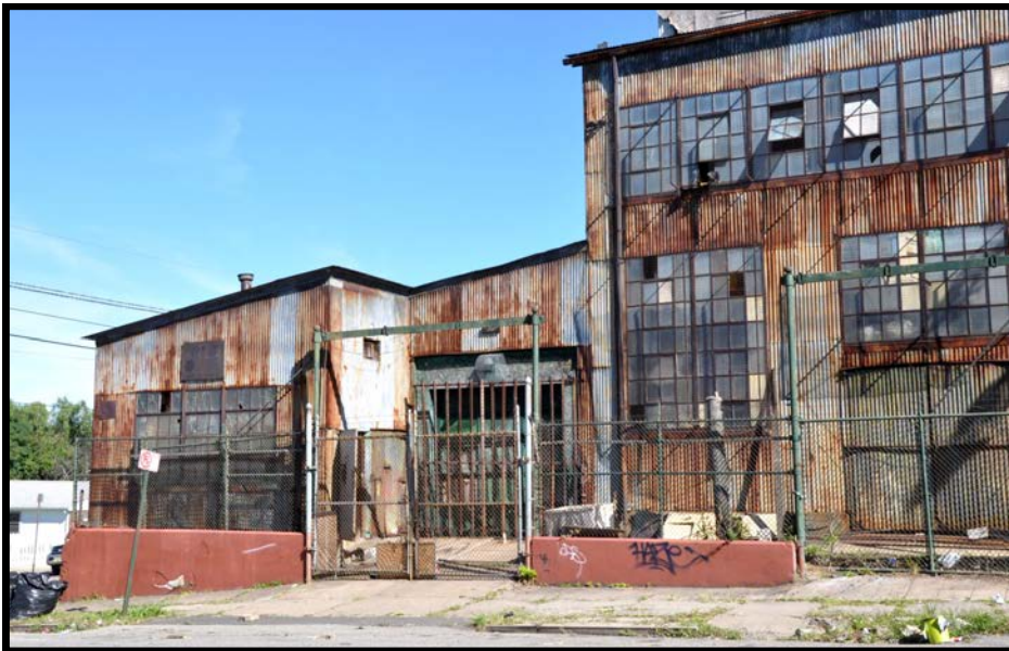
SUSQUEHANNA 11: view looking northwest from across 7th Ave. showing the Boiler House / Steam Plant's south side.