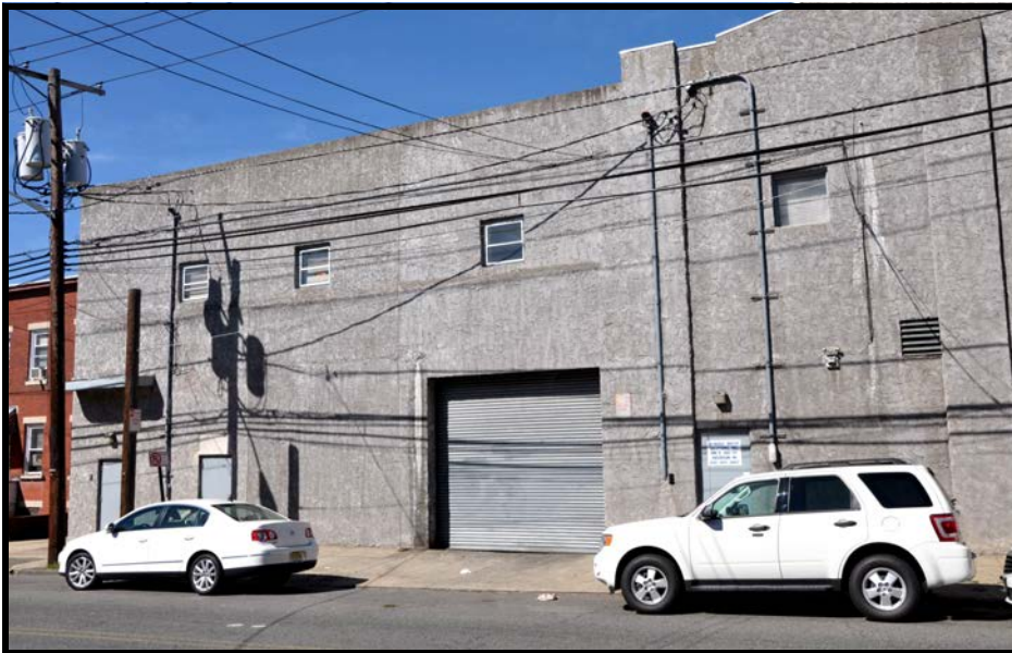
SUSQUEHANNA 3: View of east elevation of service building adjacent to Dye House, looking southwest from across 16th St..