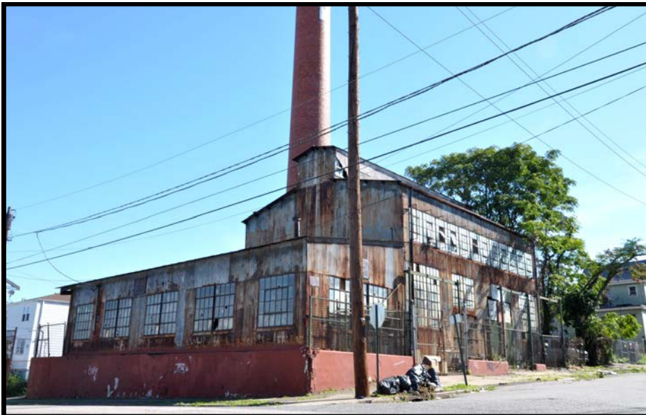
SUSQUEHANNA 7: Oblique overview looking northeast showing the Boiler House / Steam Plant likely added to the Susquehanna operation during a plant expansion in the 1940s.