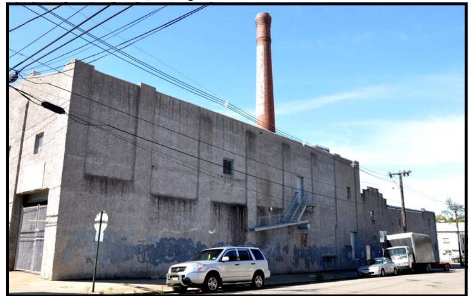
SUSQUEHANNA 4: oblique overview of north elevation of Dye House running the 7th Ave. block between 15-16th St., looking from across corner of 16th St. and 7th Ave.