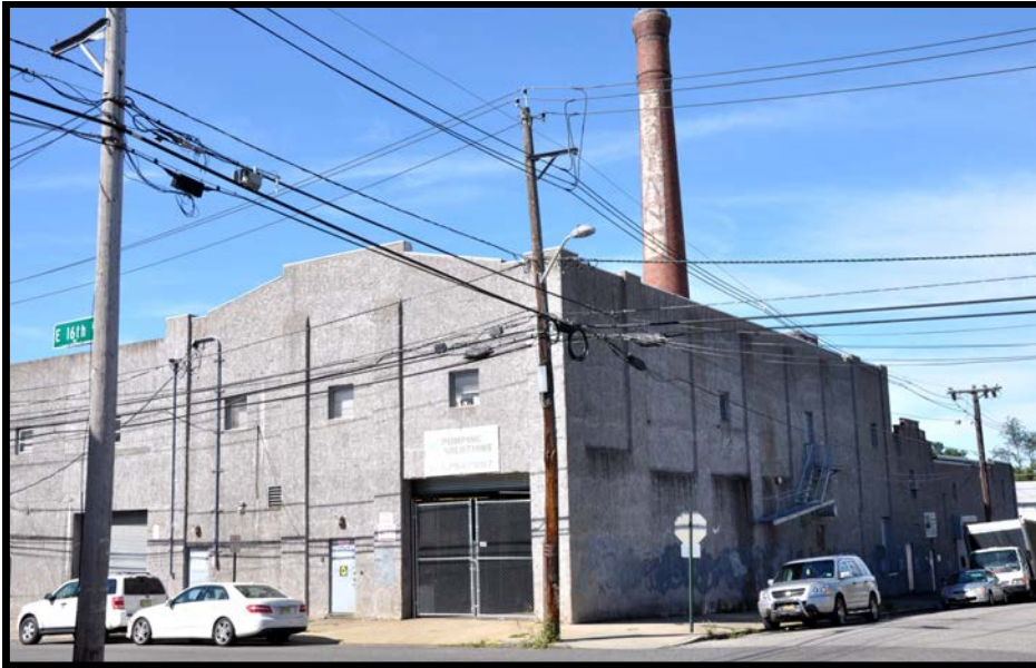
SUSQUEHANNA 1: Oblique overview of complex looking southwest from corner of 16th St. and 7th Ave.