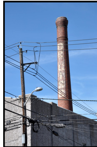
SUSQUEHANNA 8: Detail showing full height of the Susquehanna smokestack, looking southeast from 7th Ave.