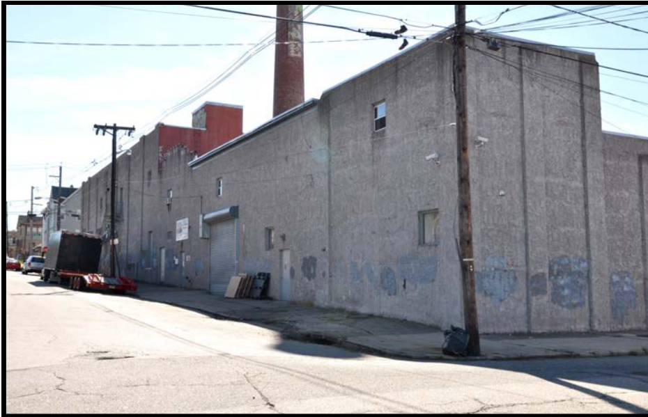
SUSQUEHANNA 5: oblique overview of north elevation of Dye Houses running the 7th Ave. block between 15-16th St., looking from across corner of 15th St. and 7th.