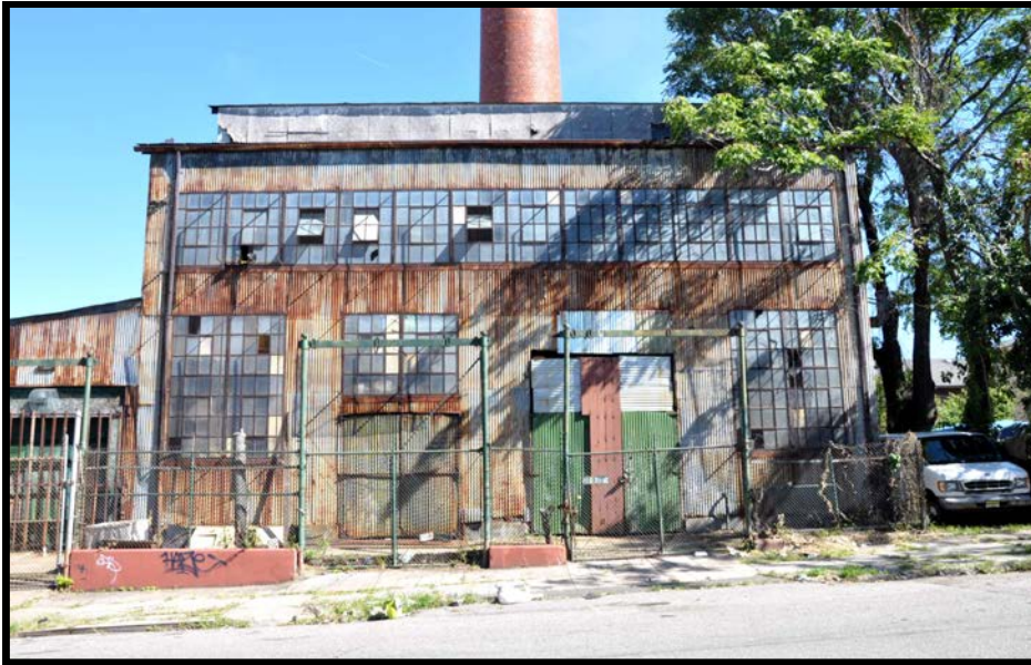
SUSQUEHANNA 9: overview looking north from across 7th Ave. showing the Boiler House / Steam Plant's south side.