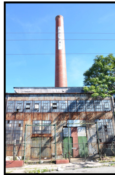
SUSQUEHANNA 12: Detail showing full height of the Steam Plant smokestack, looking north from 7th Ave.