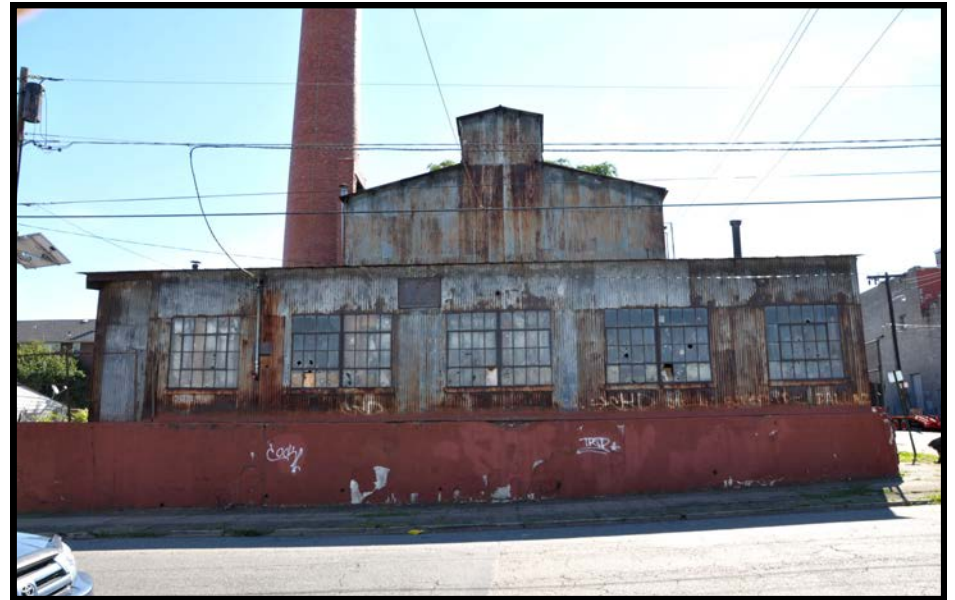
SUSQUEHANNA 10: overview looking east from across 15th St. showing the Boiler House / Steam Plant's west side.