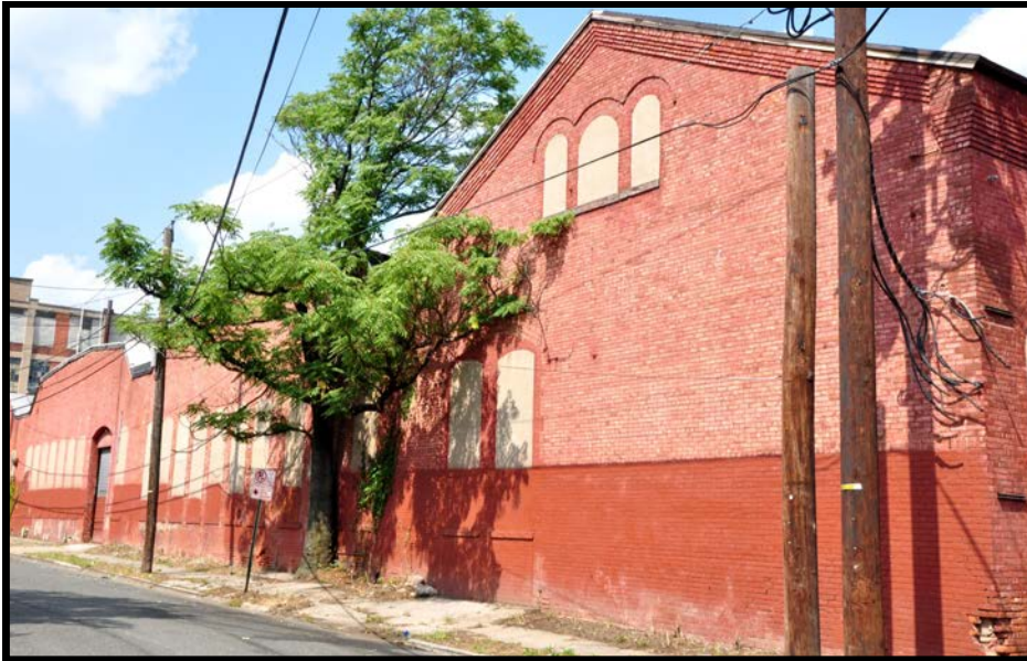
NATIONAL 1: Oblique overview of Dye Houses and Boiler House (right) looking northwest along Piercy St. from corner of Presidential and Piercy.