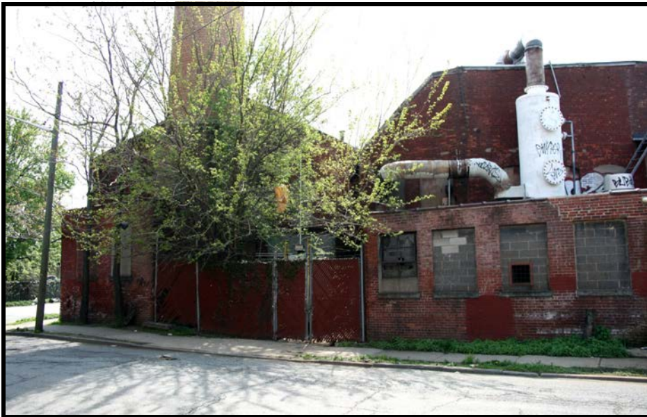
NATIONAL 7: Overview of north side of the complex, looking southwest from East Main St., Boiler House at left frame, and rear of Dye House at right frame.