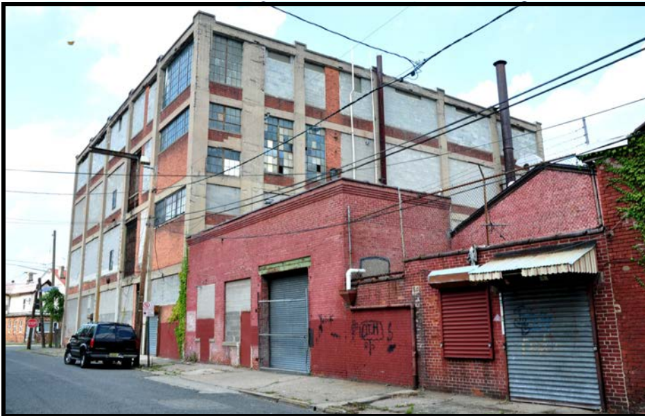
NATIONAL 3: Oblique overview of Stripping Room, Ribbon Finishing Room and 1920s Finishing mill (left frame), looking northwest along Piercy St.