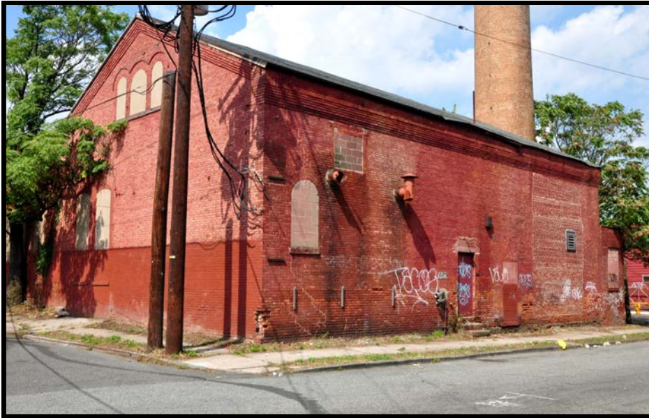
NATIONAL 5: Oblique view of the Boiler House looking north from the corner of Piercy St. and Presidential Ave.