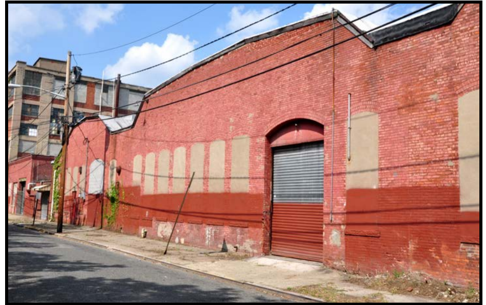
NATIONAL 2: Oblique overview of Dye Houses, Stripping Room and 1920s mill (left frame), looking northwest along Piercy St. from about mid point of the site.