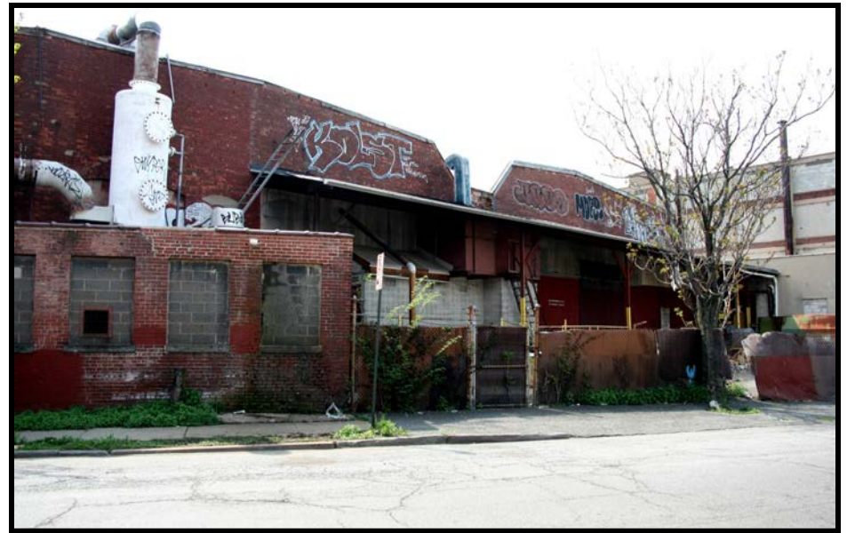
NATIONAL 8: oblique overview of loading docks and rear of Dye Houses, looking northwest from Presidential Ave.