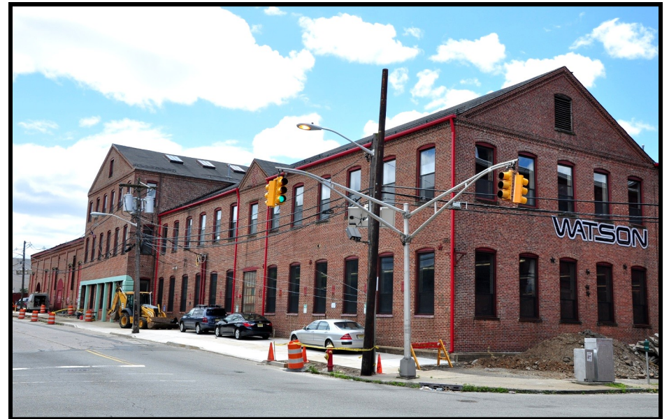
WATSON 2: current day overview, looking SW from corner of Railroad (left) and Grand St. (right). Compare to photo Watson 1.