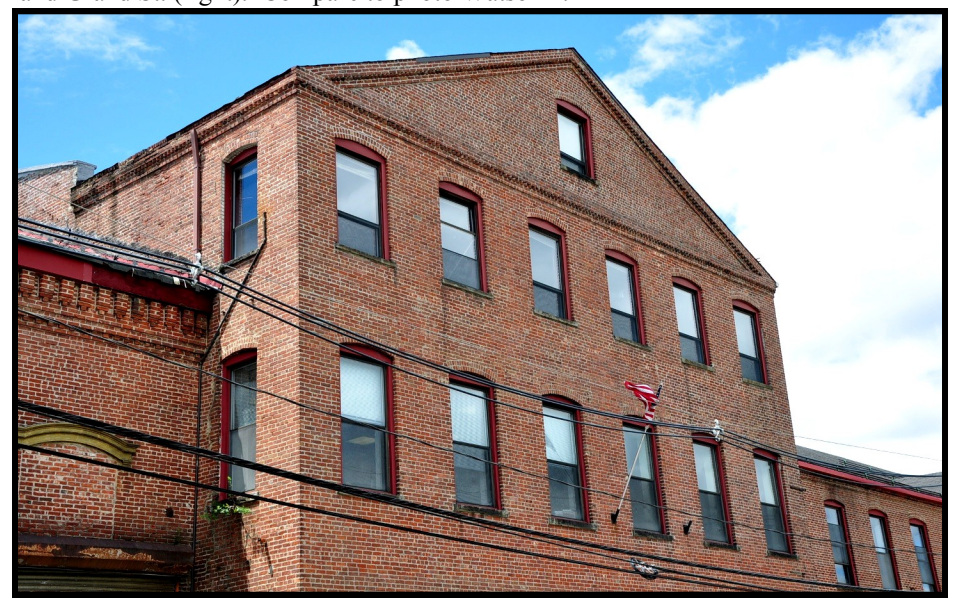
WATSON 4: close up view of E side central gable, looking NW, from Railroad Ave. with Foundry to left.