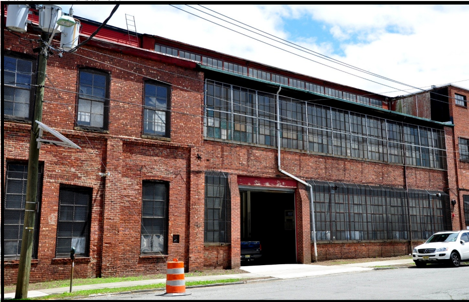
WATSON 11: detail view of Erecting Shop addition looking SE from Dale Ave.