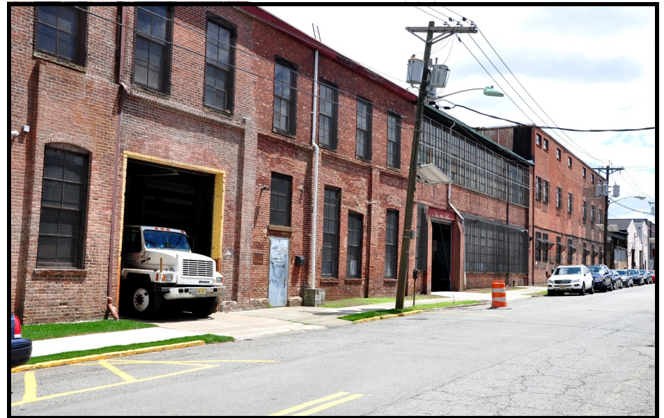
WATSON 8: view looking S along Dale Ave., showing Erecting Shop entrances.