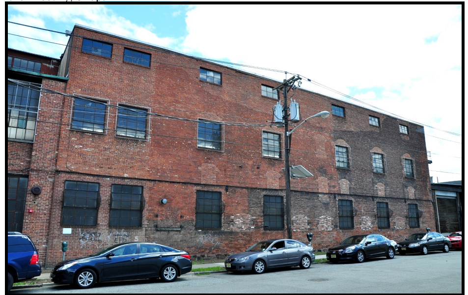
WATSON 12: detail view looking E from Dale Ave. showing West side of later addition to the complex, possibly 1940s.