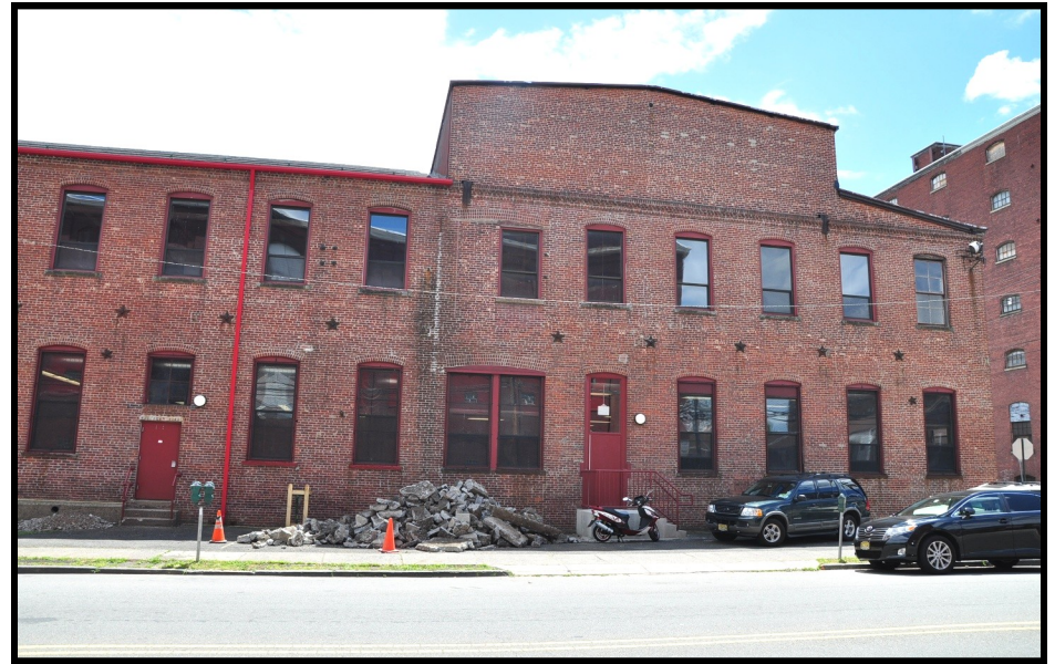
WATSON 6: detail view looking S, showing entrance modifications.