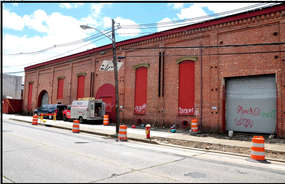
WATSON 3: detail view of Railroad Ave. east side, looking SW. This was the Foundry building, and its entrances have been modified over the years..