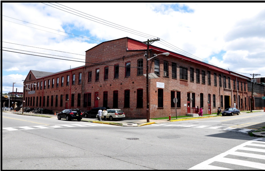
WATSON 7: oblique overview from corner of Grand St. (left) and Dale Ave. (right) looking SE, showing N and W sides of complex.