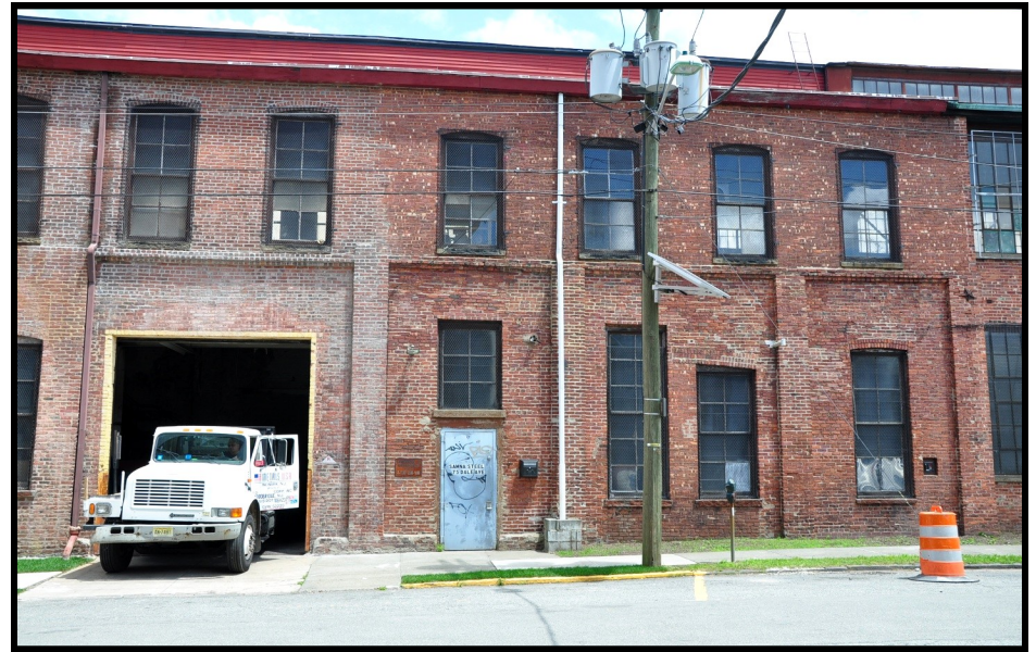
WATSON 10: detail view looking E, showing W side entrance modifications to the Erecting Shop.