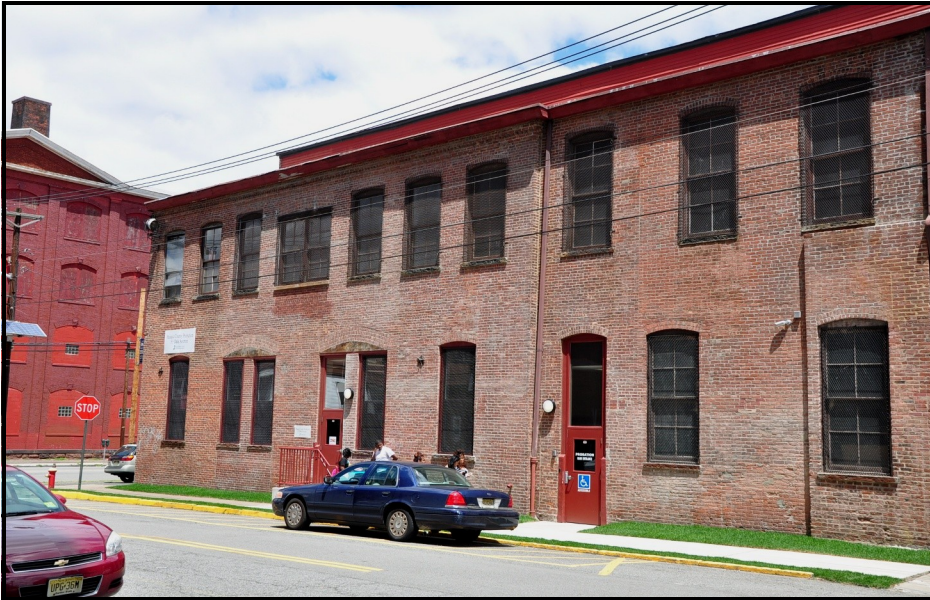
WATSON 9: oblique view of W side along Dale Ave. looking NE toward Grand St. corner in distance.