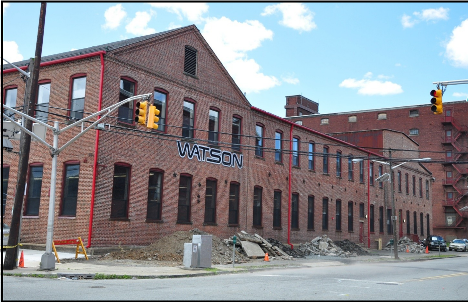
WATSON 5: oblique view looking SE along Grand St. showing N. side.