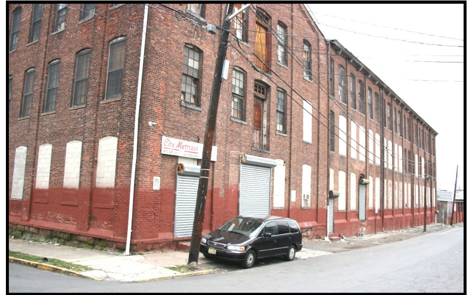
MIESCH 6: oblique overview looking SE of corner of Camden and Leslie Streets, showing the c1910 addition along Leslie street.