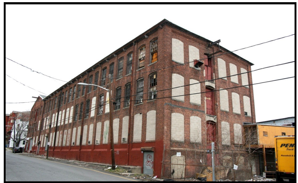
MIESCH 8: oblique overview looking SE, showing gable end and Camden St. side of the c1910 addition. The gable end of the original mill is visible at the far end of the street.