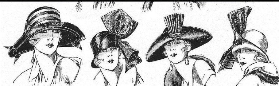
MIESCH 1: Advertisements from 1924 trade journals for the Miesch Olive Branch trade name ribbon products used primarily in the millinery trade [hats].