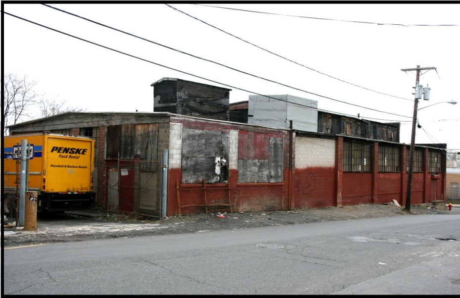
MIESCH 9: Oblique view looking SW, showing non contributing concrete block shed on Lot 2, at corner of Camden and Court Streets. This and other structures along Court Street are not included in the boundary of the Miesch mill designation, and are on a separate tax parcel altogether.