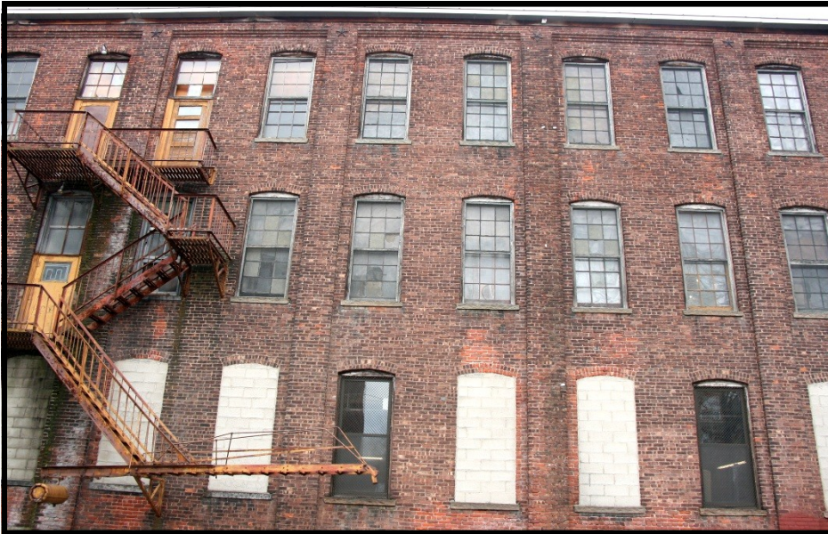
MIESCH 5: detail of Leslie St. side, showing two by two fenestration, intact windows, and similar detailing as described in previous photos.