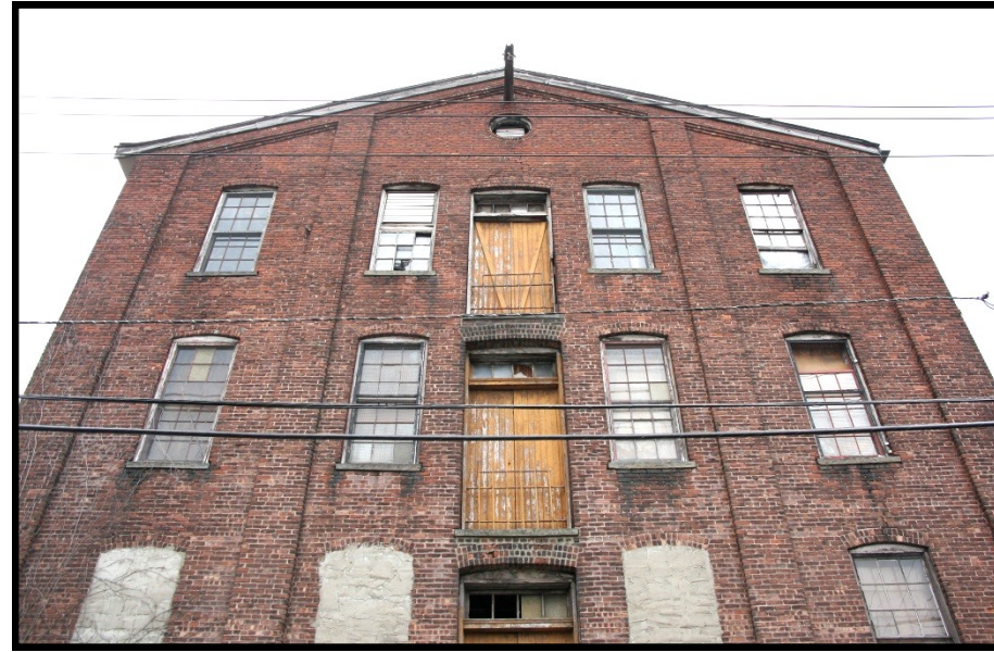
MIESCH 3: Detail of 1890 mill Courtland St. façade looking N. Note the number of intact double hung windows, central loading doors, central oculus window, stepped corbel detailing and pilaster articulation as character defining features.