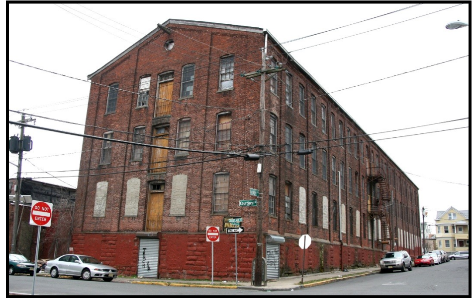
MIESCH 2: oblique overview looking NW at corner of Courtland and Leslie St. The gable end of the original Miesch mill, c1890. Note brownstone first floor (painted red)