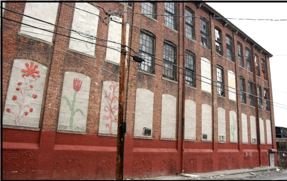
MIESCH 7: detail view looking SW, showing two by two fenestration, open ended eaves and general conditions of the Camden St. addition.