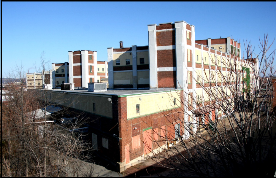
WRIGHT 9: oblique overview looking N from Madison Ave bridge showing E end and S side of Bld. 7 in foreground, and the long façade of Bld. 4 running parallel to Madison Ave.

Various addresses on Beckwith, Lindbergh, Madison Aves, Paterson, NJ B 6508 L 09, 19, 20, 21