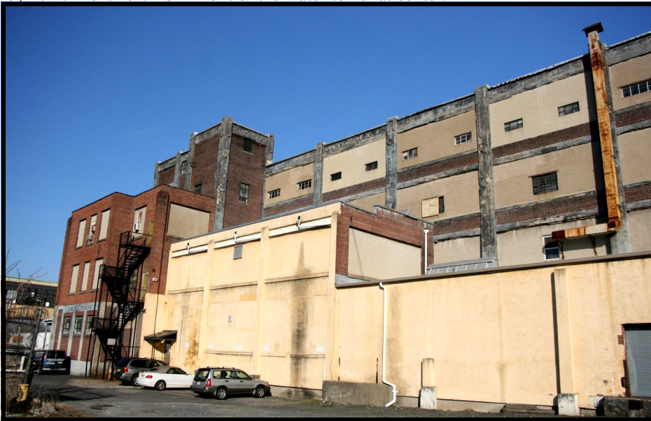
WRIGHT 3: oblique overview of rear of Bld. 1 looking NE, showing ancillary loading docks that were added to the building.