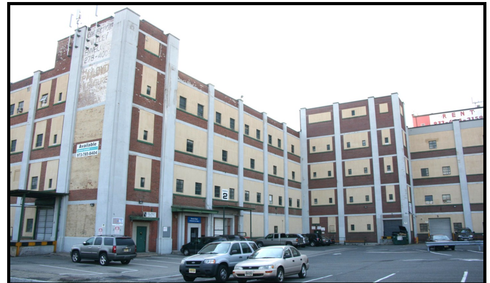
WRIGHT 12: oblique overview looking SW from Beckwith Ave. of interior corner of Bld. 2 and E side of Bld. 13.