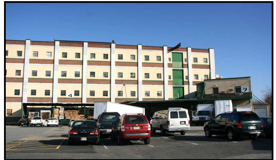
WRIGHT 8: overview of rear of Bld. 4 and end of Bld 7, looking E from interior courtyard. Bld 2 is perpendicular to Bld 4, and is just off frame left. Railroad tracks are off frame right.