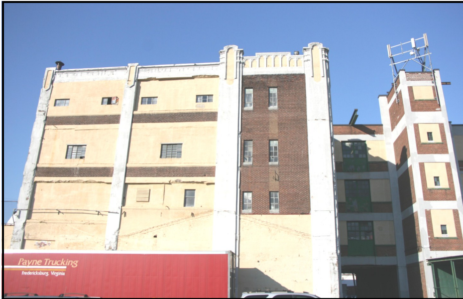
WRIGHT 5: detail view of S end of Bld. 1, looking N from courtyard parking lot. Lindbergh Pl. enters on the right, passing under Bld 2, which was added during the 1920s