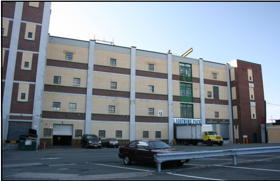
WRIGHT 13: view looking W from Beckwith Ave. of E side of Bld. 13, which is an addition made perpendicular to Bld. 2 .