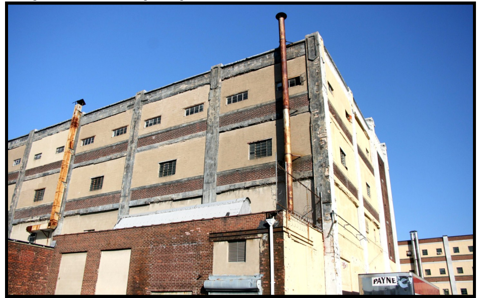
WRIGHT 4: oblique overview of rear of Bld. 1 looking NE, showing south end of building and part of interior courtyard.