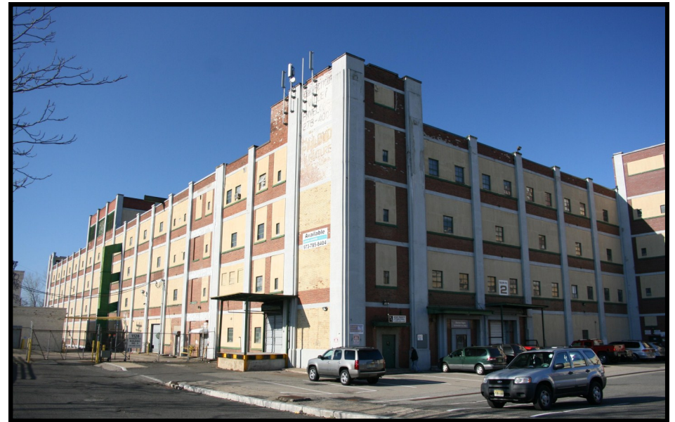
WRIGHT 14: oblique overview looking SW from Beckwith Ave. of corner of E side of Bld. 4 running on the left and N side of Bld. 2. running on the right.