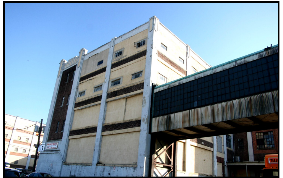
WRIGHT 2: detail view of 1916 bld. (Bld. 1), looking SE. Lindbergh Pl. runs along far side, where telephone pole is.