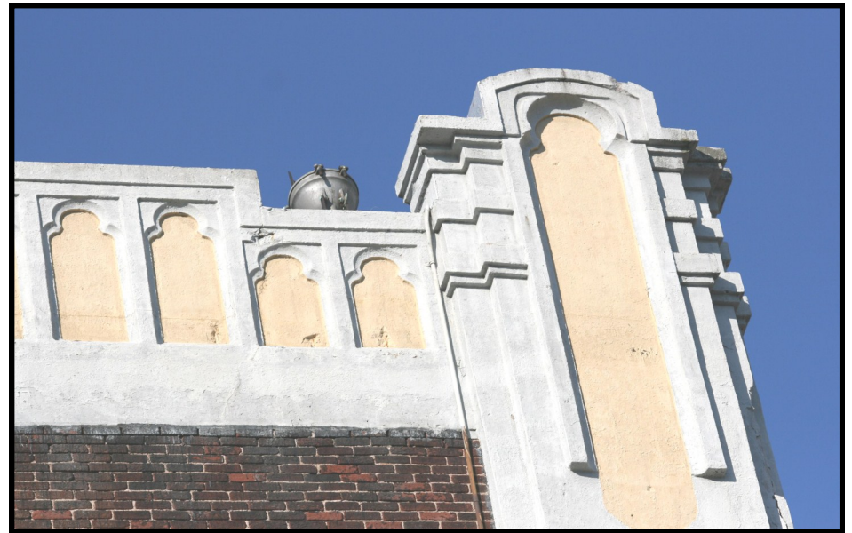
WRIGHT 6: close up view of S end of Bld. 1, looking N, showing geometrical parapet detailing in cast concrete. Such detail sets Bld. 1 apart from the complex additions made after this first bld was designed by F.W. Wentworth in 1915.