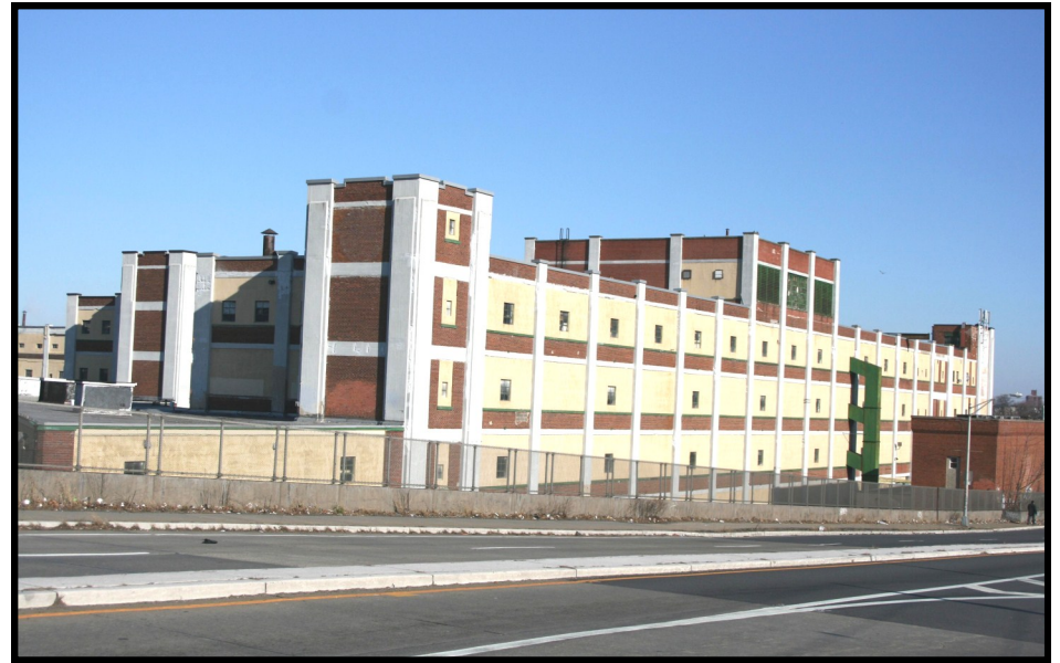
WRIGHT 10: oblique overview looking N from Madison Ave bridge the long façade of Bld. 4 running parallel to Madison Ave.