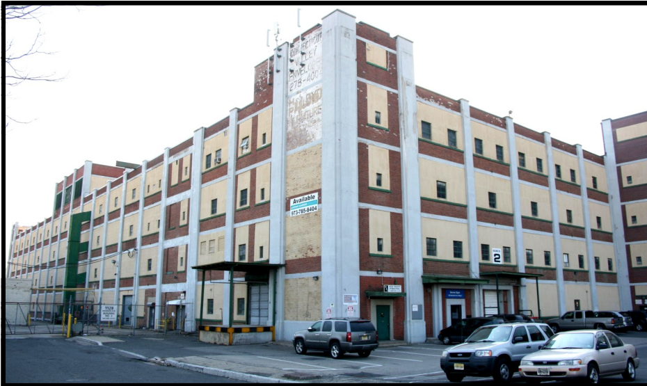
WRIGHT 11: oblique overview looking SW from Beckwith Ave. of corner of E side of Bld. 4 running on the left and N side of Bld. 2. running on the right.