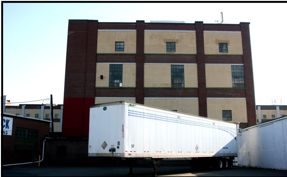
WRIGHT 15: view of N end of Bld. 13 looking S from Beckwith Ave. Bld. 2 runs perpendicular in the background.