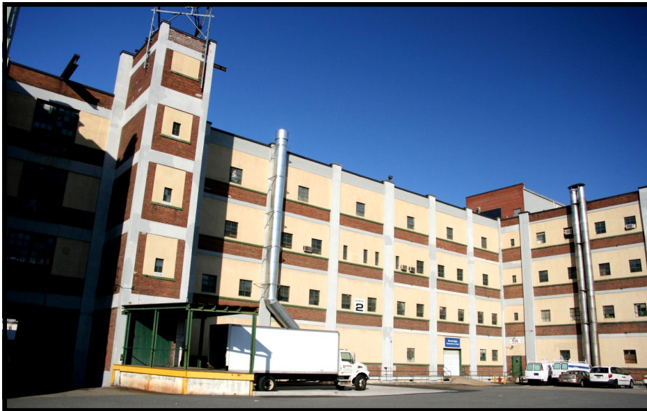
WRIGHT 7: oblique overview of rear of Bld. 2 looking NE from interior courtyard. Bld 1 is just off frame on left, Lindbergh Pl. enters courtyard at left.