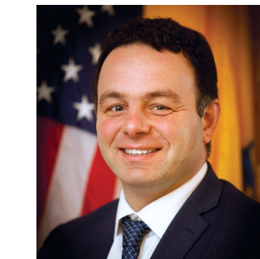
ANDRÉ SAYEGH Mayor, City of Paterson

Presorted Standard U.S. POSTAGE PAID Paterson, NJ Permit # 161