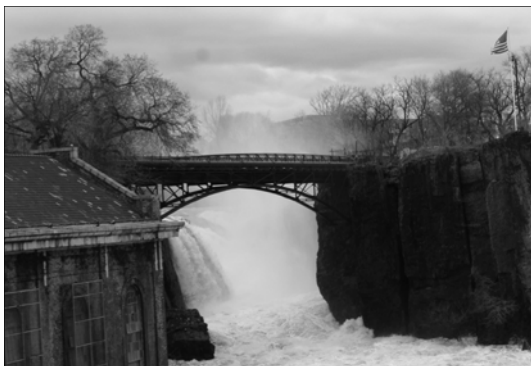
Flood levels at the Great Falls in April 2007.

For well over two decades Paterson's Great Falls Historic District Cultural Center has welcomed visitors and groups from many areas of New Jersey and the greater New York metropolitan area to tour the historic district and the Great Falls. Thousands of educators, students, seniors, and community clubs have taken advantage of our guided tour services.