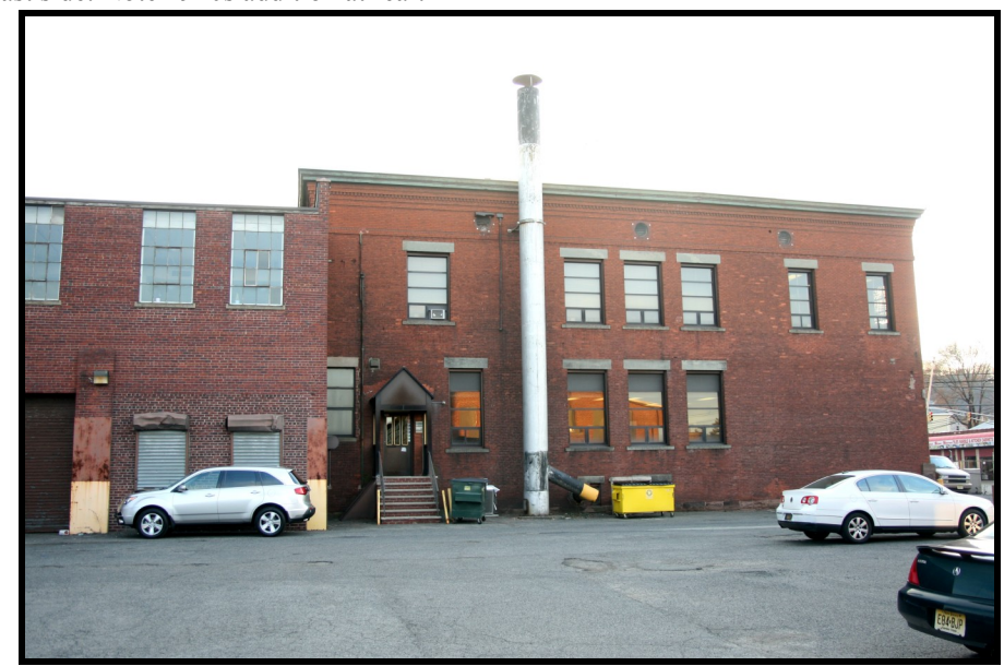
COOKE 4: Administration Building, looking W, showing E side. Note 1920s addition at rear.