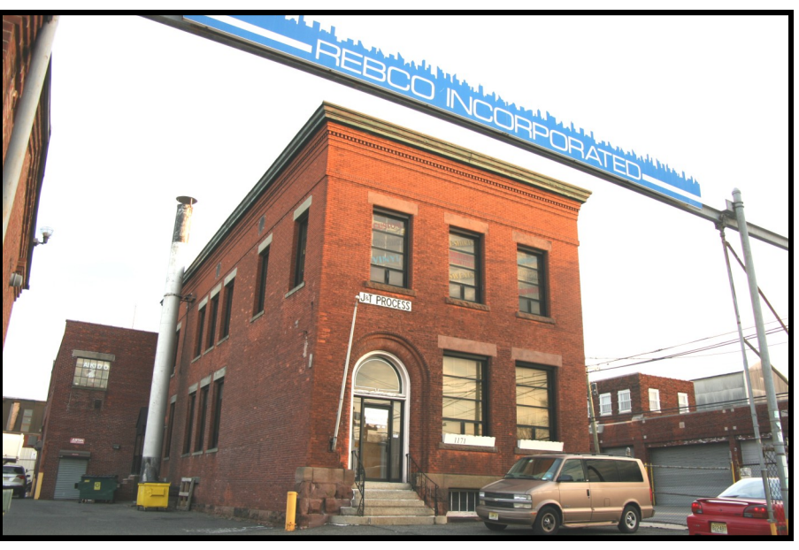
COOKE 2: Administration Building, oblique view looking SW, showing façade and east side. Note 1920s addition at rear.