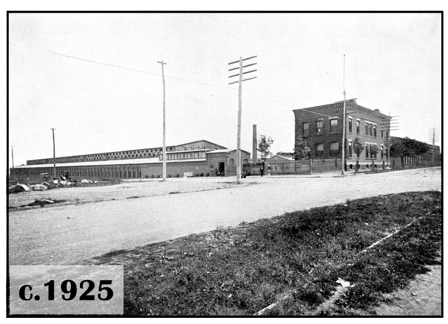
COOKE 1: c.1925 looking SE across Getty / Madison intersection, administration building rt. center, wash house & foundry lft. center