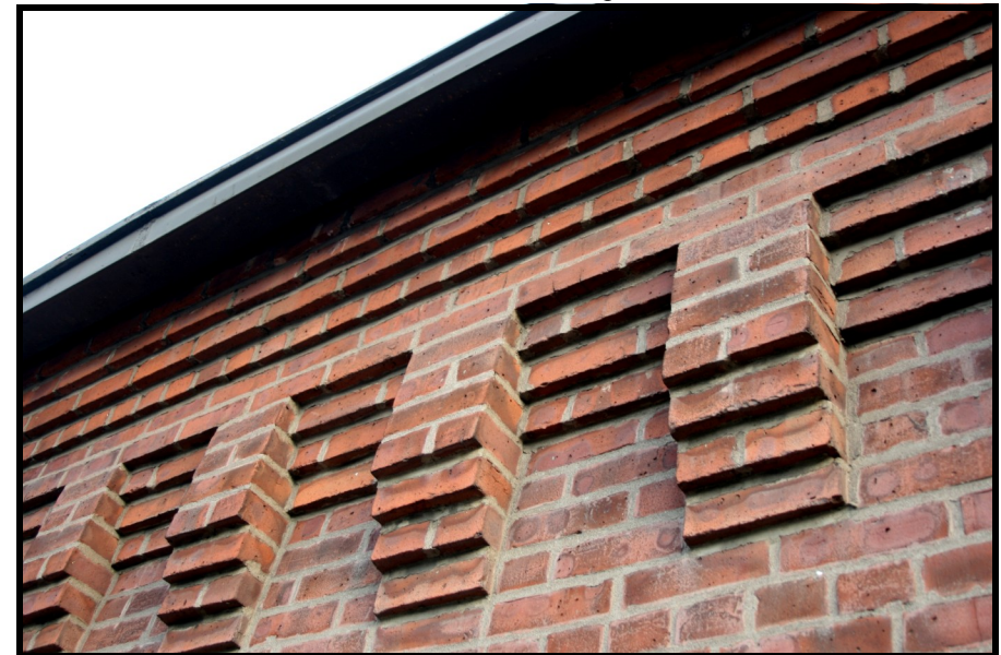
COOKE 8: detail view of stepped corbelling detail along cornice of Machine Shop.