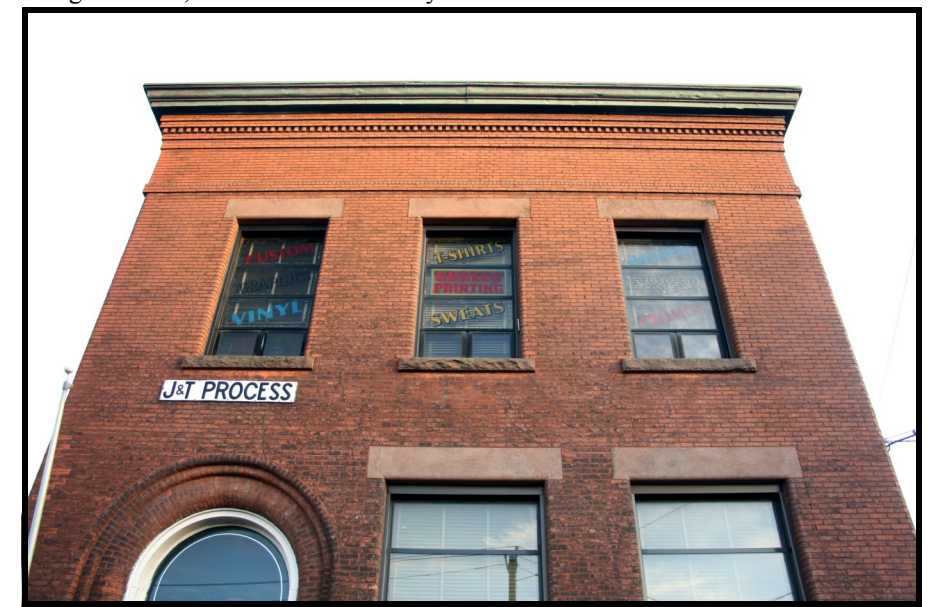
COOKE 3: Administration Building, looking S, showing N façade. Note intact cornice detail, dentils, sandstone lintels, cut stone sills, rounded brick circular entrance.