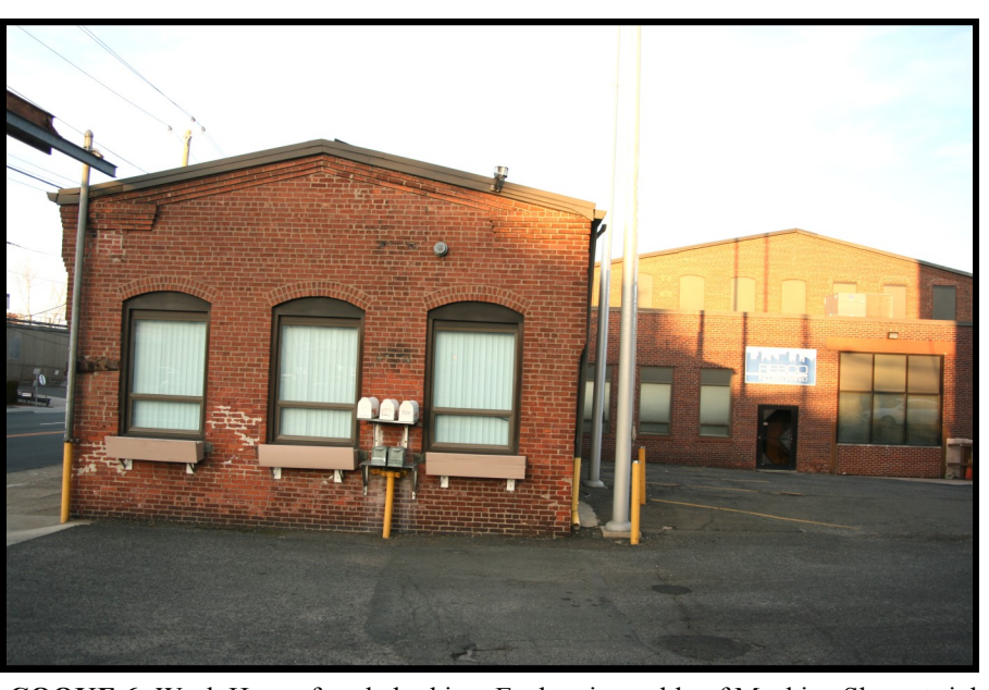
COOKE 6: Wash House façade looking E, showing gable of Machine Shop at right rear. 1920-50s brick addition to front of Machine shop is also visible.